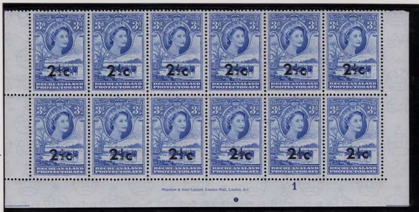
VARIETY = SPACED 'C' IN R10,3 MAKING SURCHARGE 9.7mm WIDE INSTEAD OF THE NORMAL 9.0mm

THERE ARE THREE POSITIONS OF THE FRACTION BASE RELATIVE TO THE BASE OF THE MAIN '2' I.E. ABOVE, LEVEL OR BELOW AND VARIATION ALSO EXISTS IN THE VERTICAL ALIGNMENT OF THE SURCHARGES. AS SHOWN ABOVE THE SURCHARGES IN ROW 9 ARE SOME 2mm TO THE LEFT OF THOSE IN ROW 10. IN THE DARKER SHADE OF THE BASIC STAMP THERE ARE ALSO MANY CASES OF 'DAMAGED' FRACTIONS.