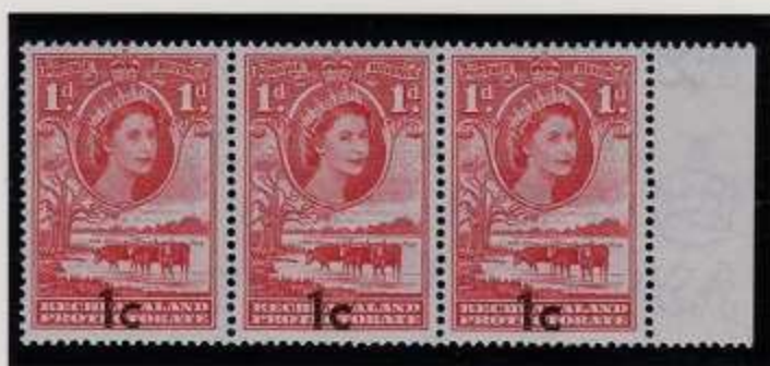
ERROR = SURCHARGE SHIFT DOWN

THERE ARE OTHER INSTANCES OF DAMAGED TYPEFACE OR INCOMPLETE IMPRESSION BUT NONE OF THOSE APPEAR TO BE CONSTANT. A FORGED INVERTED SURCHARGE HAS ALSO BEEN REPORTED.