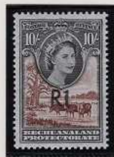
ERROR - SHIFT UP

THE REPRINT BY WATERLOW'S WAS NO DOUBT DONE IN A HURRY SINCE MANY STAMPS EXHIBIT POOR WORKMANSHIP AS SHOWN BELOW :