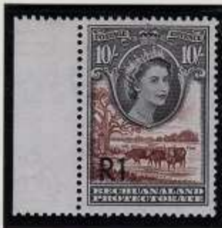
VIGNETTE SHIFT LEFT

THIS STAMP IS KNOWN WITH CANCELLATION OF 14 FEBRUARY 1961 - WAS BACKDATED AT THE POST OFFICE TO COMPLETE FIRST DAY COVER ORDERS HELD UP BECAUSE THE R1 TYPE I HAD SOLD OUT.