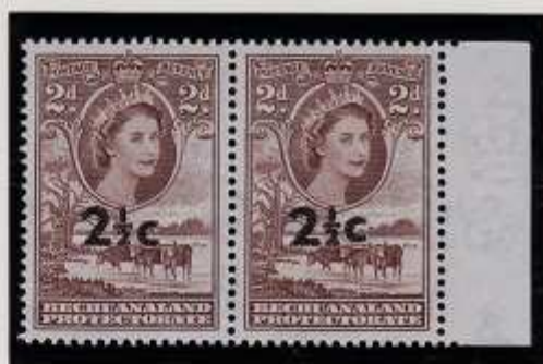
4 - TYPE I - SECOND SETTING

EXHIBITS A THICKENING OF THE TYPE, A FILLING IN OF THE ANGLE OF THE '2', FRACTIONS ARE BADLY FORMED AND THE LETTER 'C' VARIES IN THICKNESS RESULTING IN SOME 'THICK C's'.