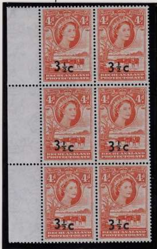
VARIETY = RAISED '3' IN VERTICAL ROW 1. ALSO NOTE VARYING WIDTHS OF SURCHARGES.

ONE PRINTING WAS MADE ON 3301 SHEETS (198060 STAMPS); ISSUED ON 6 TH JUNE 1961.