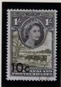
ERROR = SHIFT TO BOTTOM-LEFT - KNOWN ONLY ON ONE SHEET CANCELLED-TO-ORDER

ERROR = SURCHARGE MISPLACED TO LEFT TO THE EXTENT THAT STAMP AT FAR RIGHT DID NOT RECEIVE THE SURCHARGE. THE SLANT AT THE FOOT OF THE LEFTMOST '1' IDENTIFIES THIS STRIP AS ROW 9 OF THE ONE SHEET FOUND WITH THIS ERROR. THE TOP HALF OF THE SHEET HAD BEEN SOLD PIECEMEAL OVER THE POST OFFICE COUNTER BUT THE BOTTOM HALF REMAINED INTACT FOR SOME TIME. IT IS UNLIKELY THAT ANY FULL-WIDTH STRIPS FROM THE TOP HALF SHEET REMAIN SO THE TOTAL NUMBER OF FULL-WIDTH STRIPS IN EXISTENCE WOULD NOT EXCEED FIVE.