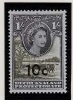
VARIETY = DAMAGED '0' IN R2,6 OF FIRST PRINTING.

SHIFTS OF THE VIGNETTE ON THE BASIC STAMP: