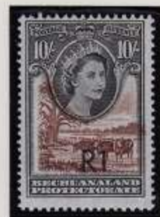
VIGNETTE SHIFT RIGHT