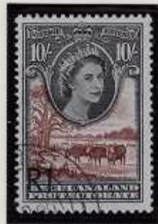
ERROR = SHIFT DOWN