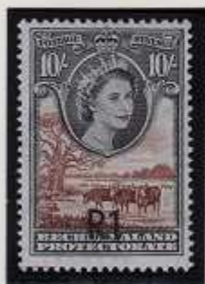
ERROR - SHIFT DOWN

WITH THE SURCHARGE NOW PLACED AT LOW CENTRE ON THE VIGNETTE TWO FURTHER PRINTINGS WERE MADE. THE FIRST WAS ON 500 SHEETS (30 000 STAMPS) AND THE SECOND PRINTING WAS ON 100 HALF SHEETS OF 30 STAMPS (3000 STAMPS). THE SAME SETTING MUST HAVE BEEN USED SINCE THERE ARE NO APPARENT DIFFERENCES.