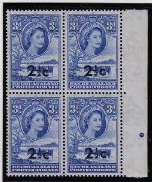
VARIETY = 'ROUNDED 'D'E' TO FOOT OF '2' IN R5,5

ONE PRINTING WAS MADE WITH 18 POINT TEMPO BOLD ON 2000 SHEETS (120 000 STAMPS). DATE OF ISSUE WAS 14 TH FEBRUARY 1961.