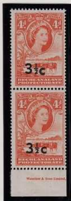
THICK 'C' VARIETY IN R 9,3