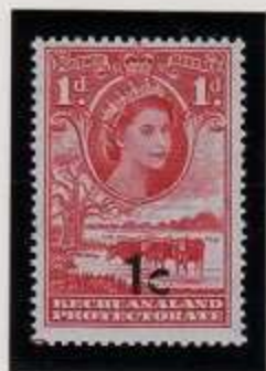
VAR. = BROKEN 'C' IN 'R 5,4

ONE PRINTING WAS MADE ON 5700 SHEETS (324 000 STAMPS). DATE OF ISSUE WAS 14 TH FEBRUARY 1961.