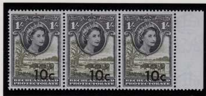
ERROR = SURCHARGES SLOPING DOWN TOWARDS RIGHT.