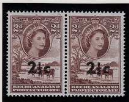
5 - TYPE II - THIRD SETTING

THE DIGIT, FRACTION AND LETTER 'C' ARE STILL ON THE SAME BASELINE. VERTICAL ROW 6 HAS THE 'C' RAISED. SURCHARGE SLANTS SLIGHTLY UP FROM LEFT TO RIGHT.