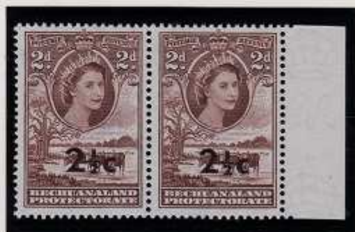
2 - TYPE II - FIRST SETTING

THE DIGIT '2' THE FRACTION AND LETTER 'C' ALL SIT ON THE SAME BASELINE. THE SURCHARGE IS A CLEAR TYPE FACE NO SMUDGING AND THE LETTERS 'C' ARE OF GOOD ROUND SHAPE. THE DIGIT '2' IS SHARP POINTED.