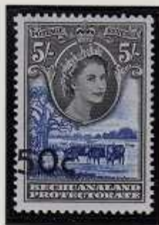
ERROR = SHIFT LEFT

THREE PRINTINGS IN 18 POINT TEMPO BOLD WERE MADE. THE FIRST OF 700 SHEETS (42,000 STAMPS) WAS RELEASED ON 14TH FEBRUARY 1961. THE SECOND OF 327 SHEETS (19,620 STAMPS) WAS ISSUED ON 6TH JUNE 1961, AS WAS THE THIRD PRINTING ON 280 HALF-SHEETS OF 30 STAMPS (8,400 STAMPS). ONLY ONE SETTING APPEARS TO HAVE BEEN USED SINCE NO DIFFERENCES BETWEEN THE PRINTINGS CAN BE FOUND. VARIETIES DID NOT OCCUR BUT SOME SHIFTS IN THE SURCHARGE POSITION WERE NOTED.