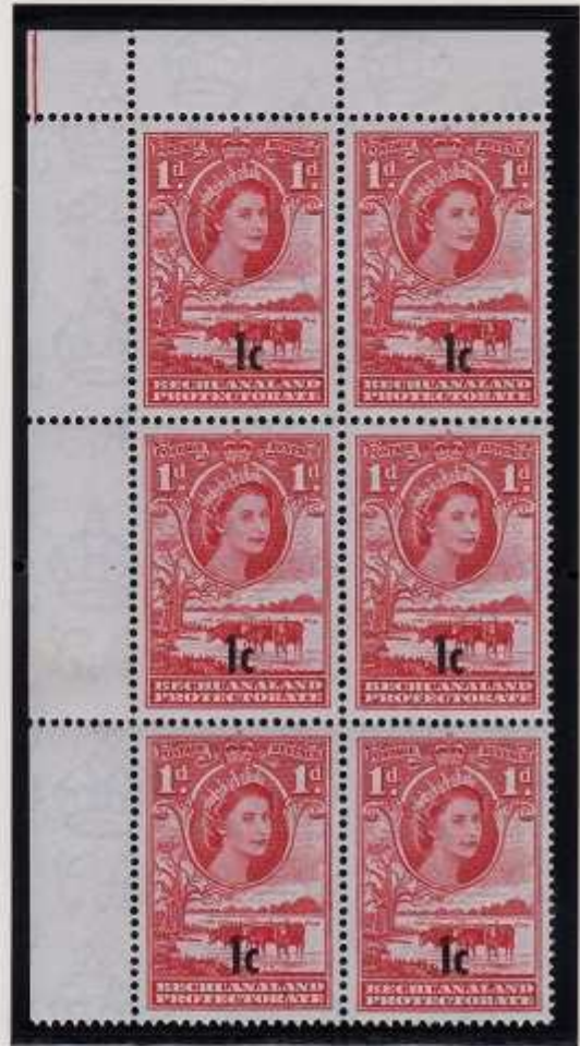
SECOND SETTING ROW 1 SET TO RIGHT