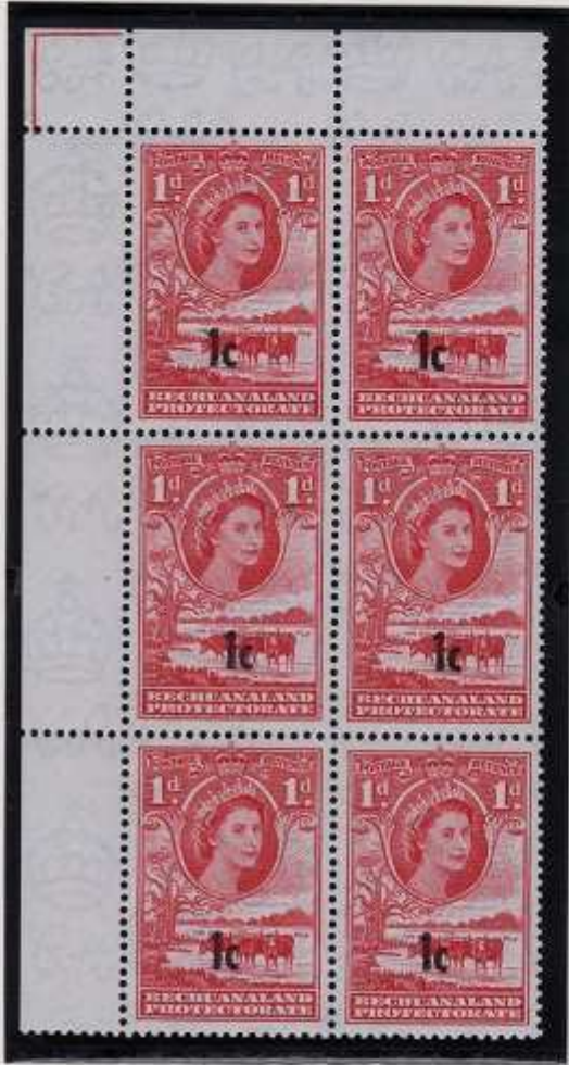
FIRST SETTING ROW 2 SET TO RIGHT