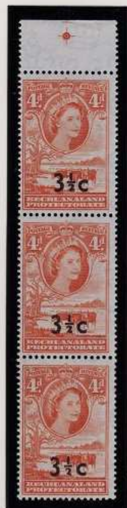
BROKEN 2 IN FRACTION R.34. NOT A CONSTANT VARIETY.