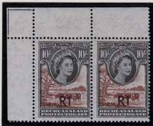
POOR CENTERING OF PERFORATIONS