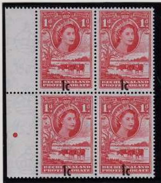
ERROR = SURCHARGE SHIFT DOWN - ON SECOND SETTING.