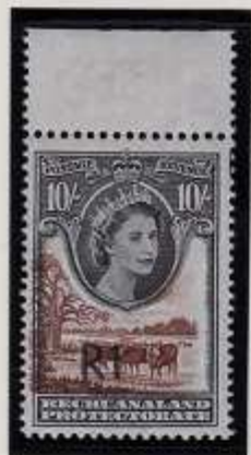
VIGNETTE SHIFT LEFT