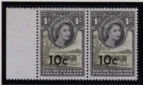
THE FIRST PRINTING HAS THE SURCHARGE NORMALLY PLACED CENTRALLY OR TO THE LEFT.

TWO PRINTINGS WERE MADE WITH 18 POINT TEMPD BOLD, THE FIRST PRINTING ON 800 SHEETS (48 000 STAMPS) WHICH WERE ISSUED ON 14TH FEBRUARY 1961 AND THE SECOND PRINTING ON 1052 SHEETS (63120 STAMPS) WHICH WERE ISSUED PROBABLY DURING JUNE 1961.