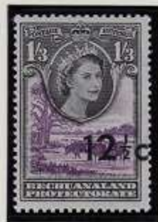
ERROR = SHIFT RIGHT