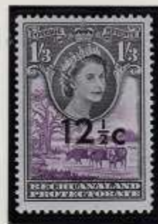
ERROR = SHIFT UP