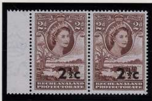
1 - TYPE I - FIRST SETTING

TWO PRINTINGS WITH 18 POINT TEMPO BOLD WERE REPORTED OF RESPECTIVELY 10 000 SHEETS (600 000 STAMPS) AND 19255 SHEETS (1 155 300 STAMPS). THE FIRST ISSUE WAS NOT AVAILABLE ON 14 TH FEBRUARY 1961 BUT APPEARED SHORTLY AFTERWARDS. IT SOON BECAME APPARENT THAT MORE THAN TWO PRINTINGS HAD TAKEN PLACE; THE CLASSIFICATION AS PROPOSED BY BROWNLOW IN THE SOUTH AFRICAN PHILATELIST APRIL 1962 PAGE 58 INDICATES THAT NO FEWER THAN FIVE PRINTINGS TOOK PLACE IN THE SEQUENCE AS ILLUSTRATED BELOW :