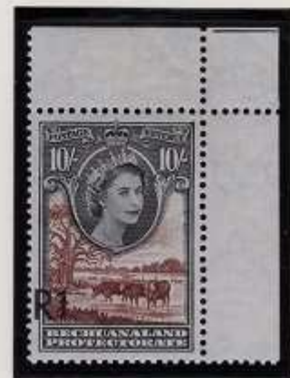
ERROR = SHIFT LEFT