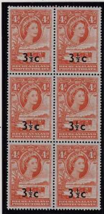
VARIETY = THICK 'C' IN R.7,3. OTHER LESS PRONOUNCED INSTANCES OF THICK 'C' EXIST.