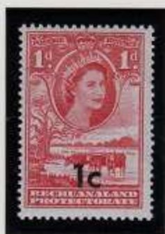
VAR. = FLAT TOP TO '1' IN 'R 7,4