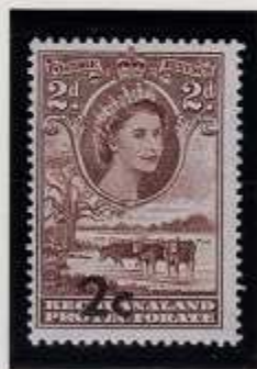
ERROR = SHIFT DOWN

VARIETY = BROKEN 'C' IN R2,1. OTHER NON-CONSTANT BROKEN 'C's' EXIST.