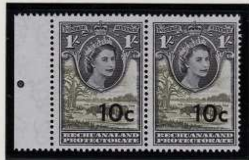
THE SECOND PRINTING HAS THE SURCHARGE NORMALLY PLACED TO THE RIGHT.