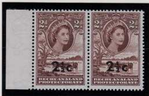
3 - TYPE II - SECOND SETTING

THE BASE OF THE FRACTION IS BELOW THE BASE OF THE DIGIT '2' AND THE LETTER 'C' WHICH SHARE A COMMON BASELINE. THE SURCHARGE IS A CLEAR TYPE FACE WITH THE LETTER 'C' OF GOOD ROUND SHAPE.