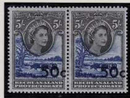
ERROR = SHIFT RIGHT

THREE PRINTINGS IN 18 POINT TEMPO BOLD WERE MADE. THE FIRST OF 700 SHEETS (42,000 STAMPS) WAS RELEASED ON 14TH FEBRUARY 1961. THE SECOND OF 327 SHEETS (19,620 STAMPS) WAS ISSUED ON 6TH JUNE 1961, AS WAS THE THIRD PRINTING ON 280 HALF-SHEETS OF 30 STAMPS (8,400 STAMPS). ONLY ONE SETTING APPEARS TO HAVE BEEN USED SINCE NO DIFFERENCES BETWEEN THE PRINTINGS CAN BE FOUND. VARIETIES DID NOT OCCUR BUT SOME SHIFTS IN THE SURCHARGE POSITION WERE NOTED.