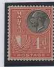
Black & paler red.