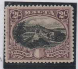
Both colours lighter.