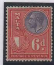
Both colours lighter.