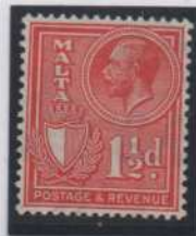
Paler rose red.