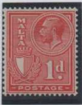
1-4-27 Rose red.