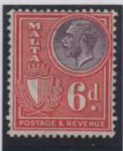
Violet & scarlet.