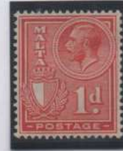
Paler rose red.