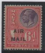
Violet & scarlet

Details concerning the overprinting are not available.