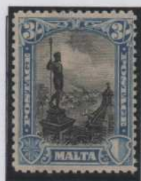
Black & blue.