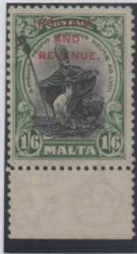
Black & green