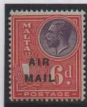
Deep violet & Deep scarlet