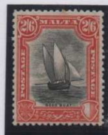
Black & vermilion.