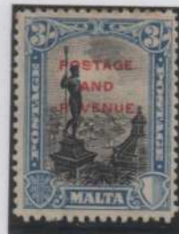
Black & blue.