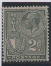
1-4-27 Greenish grey.