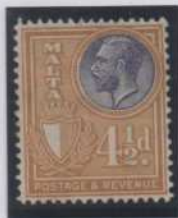
Lavender & ochre.