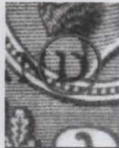
Damaged 'D' in AND.