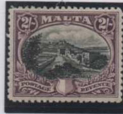
Black & purple.