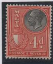
Black & red.