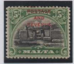
Black & green