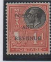
Black & Salmon.