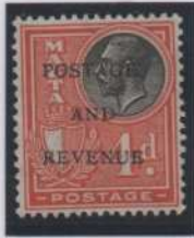
Black & orange red.