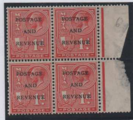
Red. Thicker paper.

The Colour, Gum and Paper changes evident in the stamps of all three of these issues points to there being more than one printing for each. As yet, no details are known.