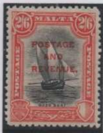
Black & vermilion