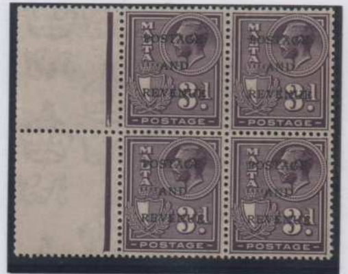
Both blocks show the damaged 'D' in overprint, which occurs on each stamp in the 2nd vertical row of each pane and denomination.