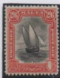
Black & Vermilion.