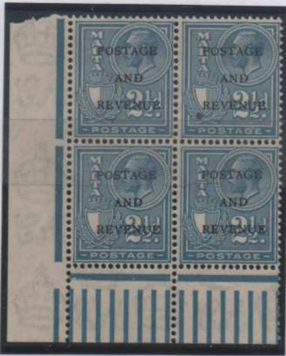
Block from top pane showing Pillared Gutter margin between top and bottom panes.