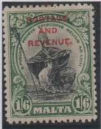
Black & green