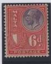
5-5-26 Violet & scarlet.