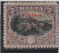
Black & purple.