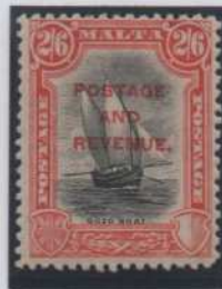
Black & vermilion