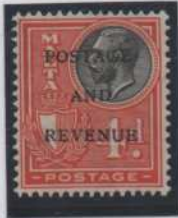
Black & red.