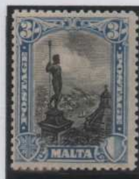
Both colours paler