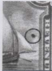
Unrecorded Printing Flaw, Plate position and whether permanent or Transient are not known.