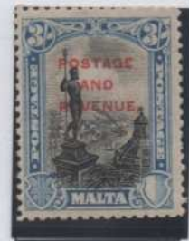
Black & blue.