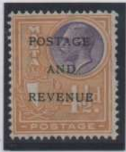
Lavender & ochre.