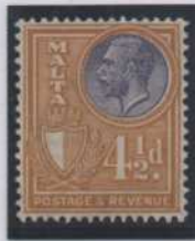
Lavender & ochre.