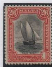
Both colours paler