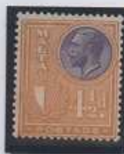
6-4-26 Lavender & ochre.