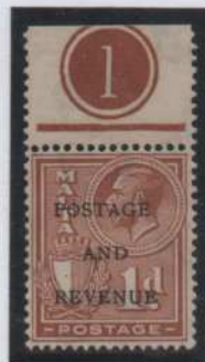
Plate numbers appear above stamps 2 & 11 in the top pane and below stamps 2 & 11 in the bottom pane. This is stamp 11, Top pane as it does not have broken 'D'.