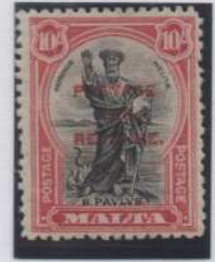
Black & carmine.