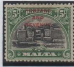
Black & green