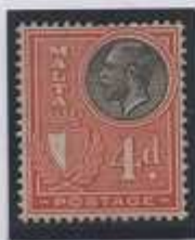
6-4-26 Black & red.