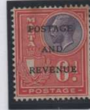
Both colours lighter.