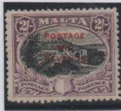
Black & purple.