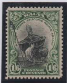
Black & green.