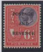
Violet & scarlet.