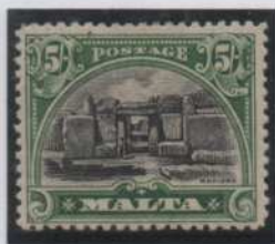
5-5-26. Black & green