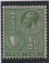
5-8-26 Yellow green.