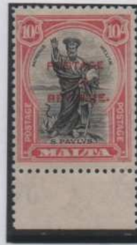
Black & carmine.