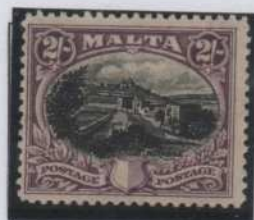
Black & purple.