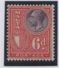
Both colours lighter.

2½ d & 3 d are printed from single working plates. 4 d to 6 d are printed from double working plates.