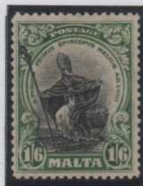
Black & green.