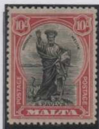
9-2-27. Black & carmine.