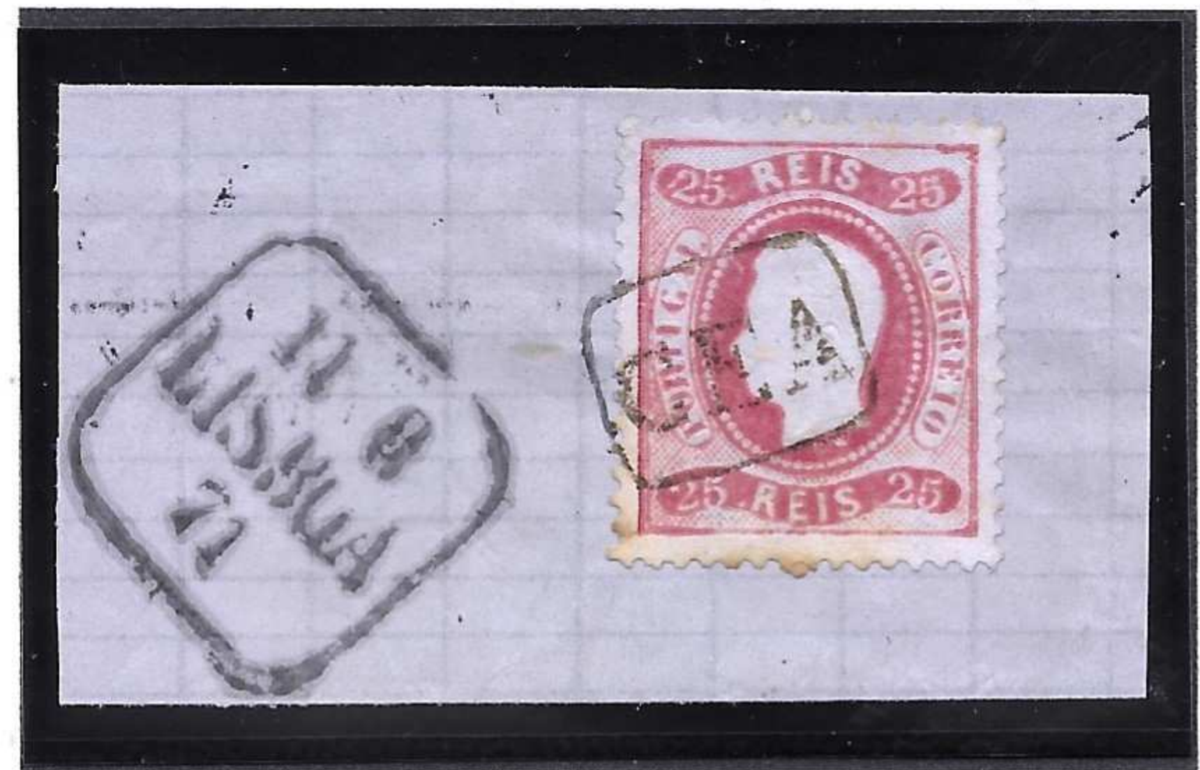
Die XIV on piece, obliterated with framed nominal "CEA" postmark