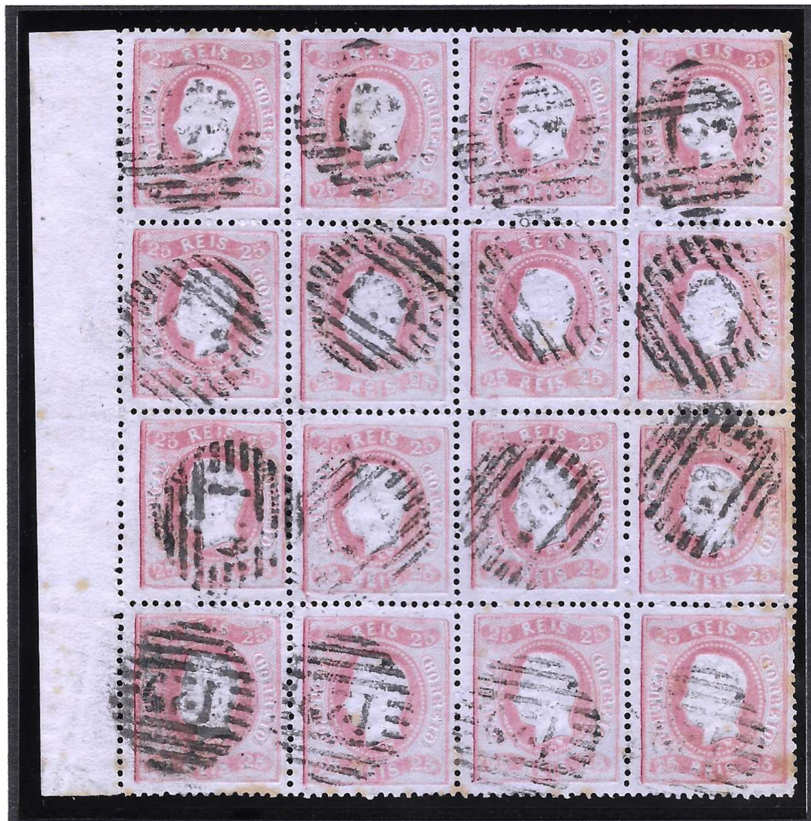
Block of sixteen die VII, obliterated with "129" bar postmark of the first postal reform, from Pinhel