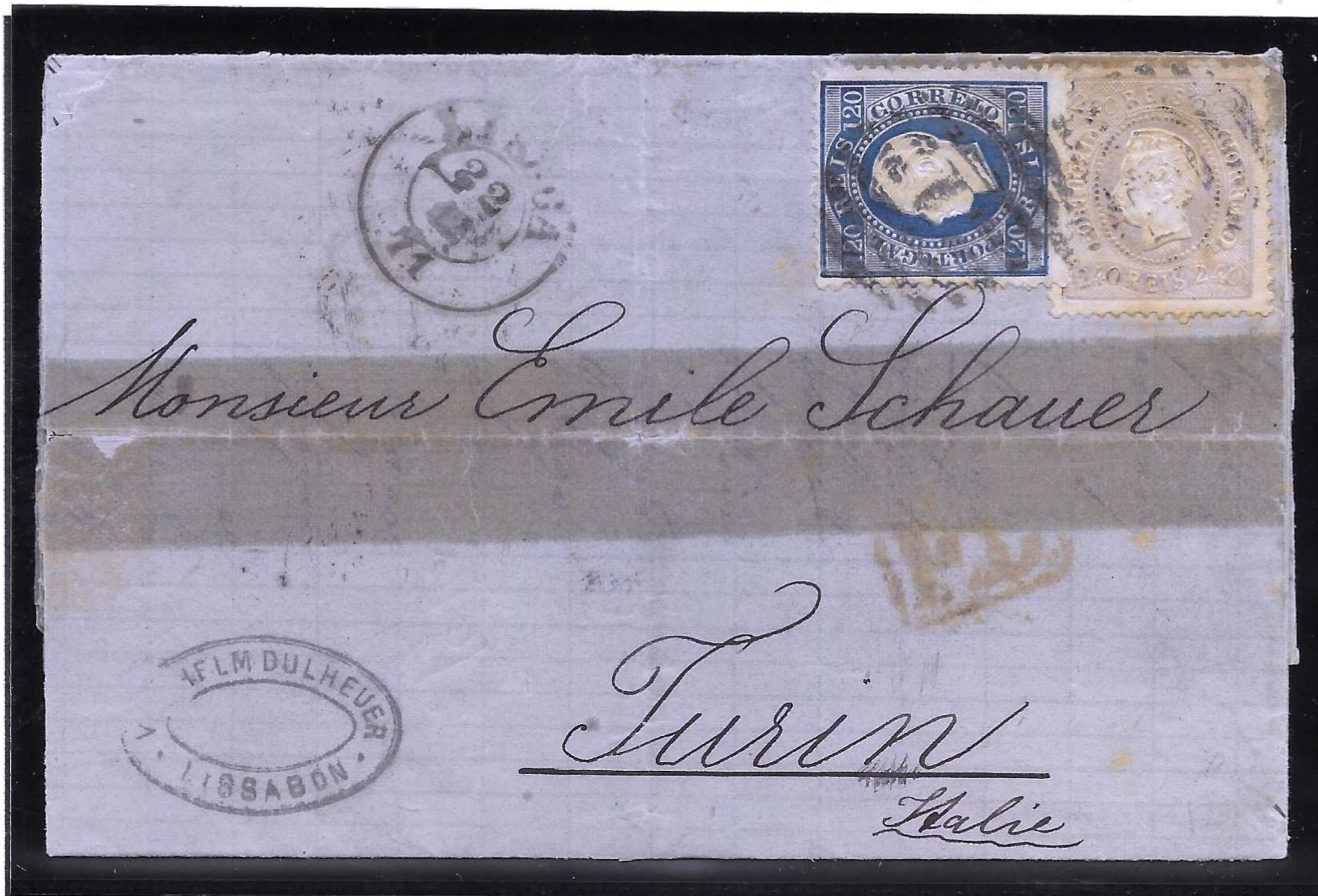
Folded letter sent from Lisbon to Turin (Italy), on 22.12.1871, franked with a copy of 240 Réis and 120 Réis blue from the 1870/76 King Luís I straight label issue, obliterated with "1" oval bar postmark of the second reform, to pay the correct third rate of a letter to Italy with weight between 20 and 30g.