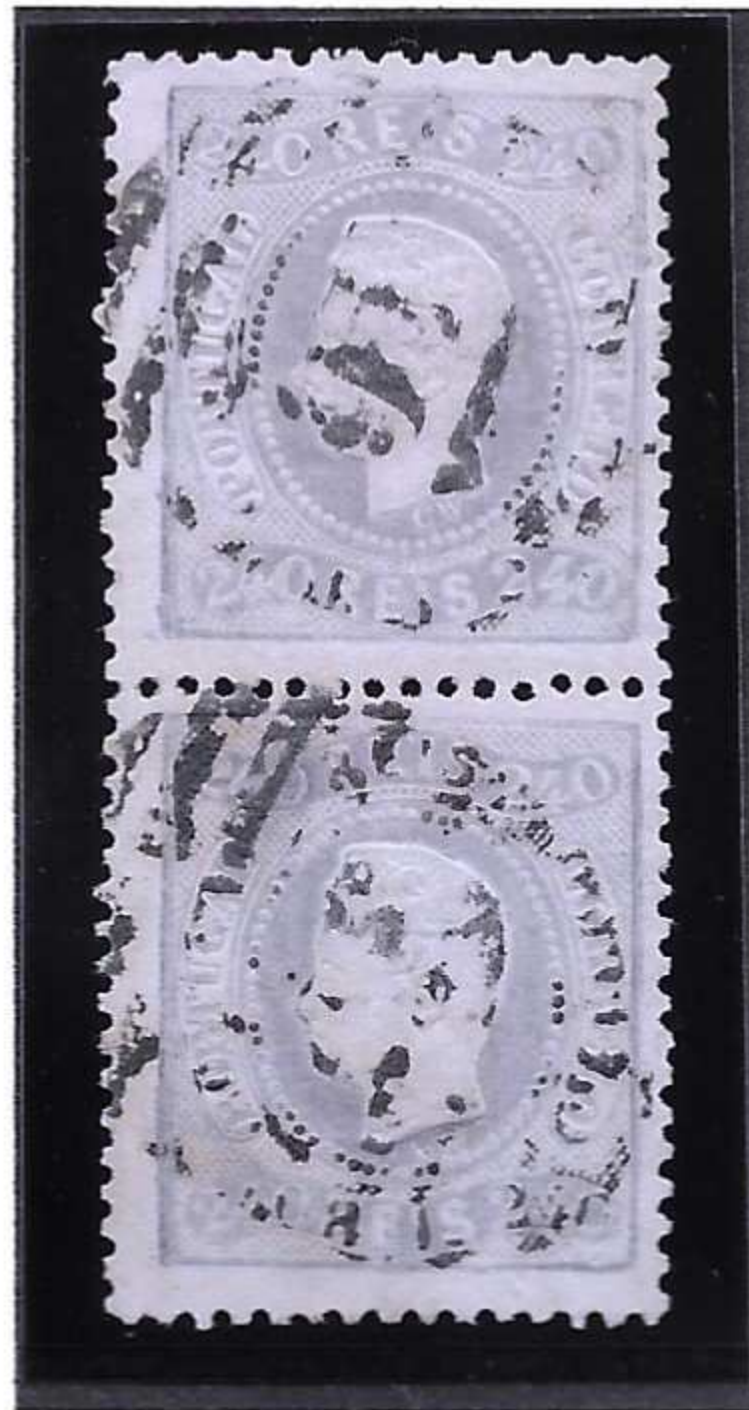
Vertical pair, obliterated with an unreadable oval bar postmark from the second reform