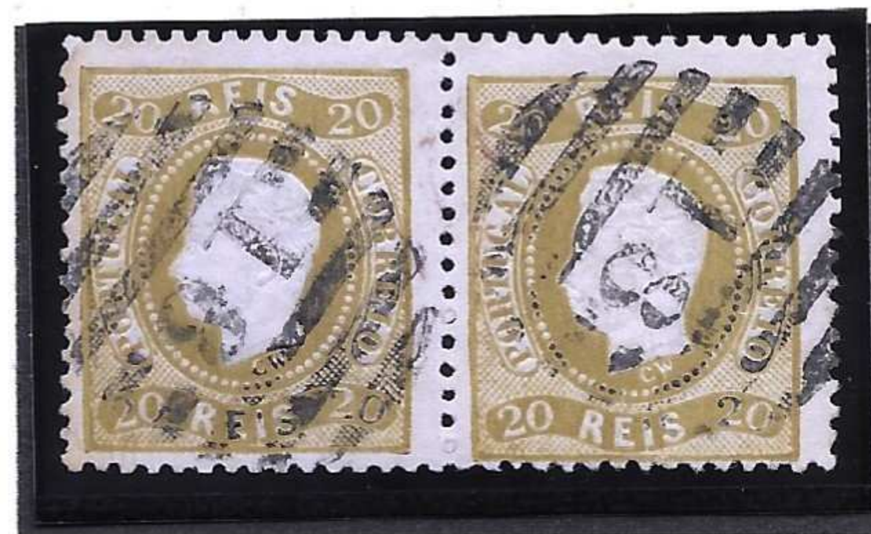
Horizontal pair, obliterated with "18" oval bar postmark of the second postal reform, from Cascaes