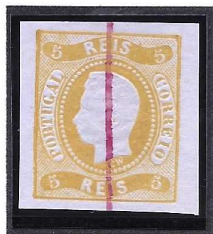
Yellow with red handwritten trace