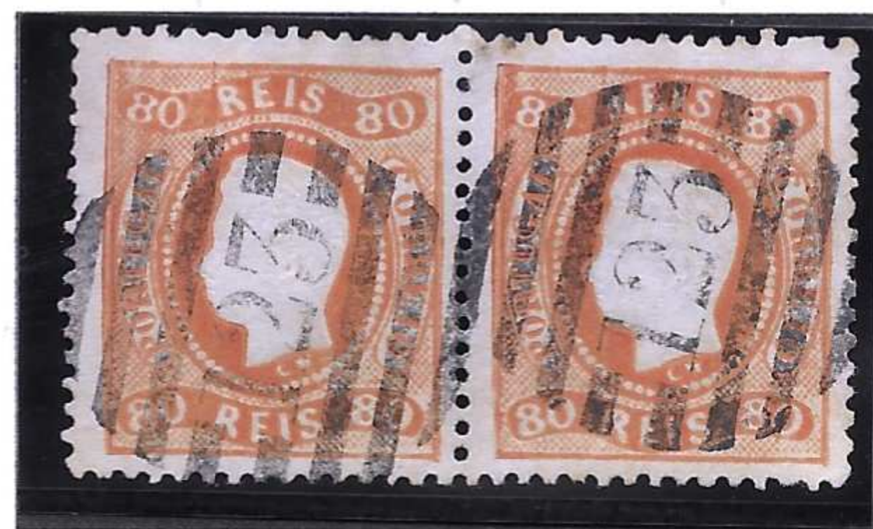
Pair obliterated with "123" oval bar postmark of the second postal reform, from Peso da Regua