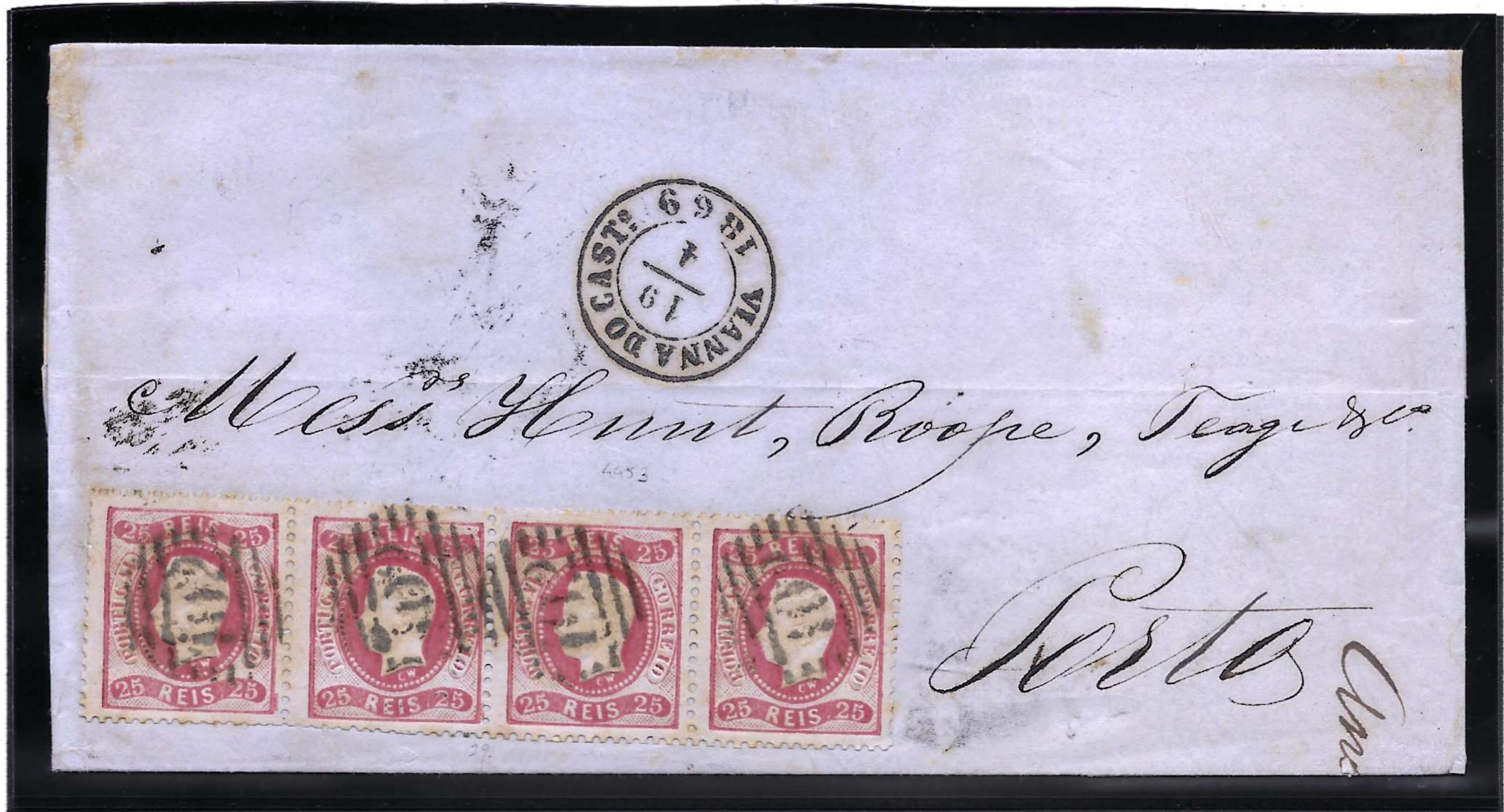
Folded letter sent from Vianna do Castelo to Porto, on 19.4.1869, franked with a die VII strip of four, to pay the fourth internal rate, for weight between 30 and 37,5g. Stamps obliterated with "102" bar postmark of the first postal reform, from Vianna do Castelo.

1867 -70 King Luís I curved label perforated, 25 Réis Rose