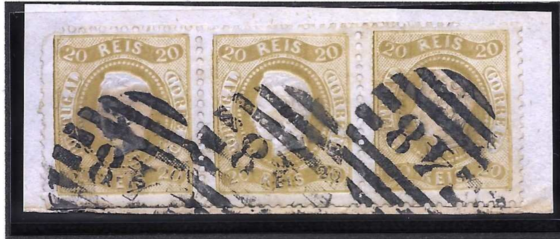
Horizontal strip of three stamps, on piece, obliterated with "48" oval bar postmark of the second postal reform, from Arcos de Valle de Vez.