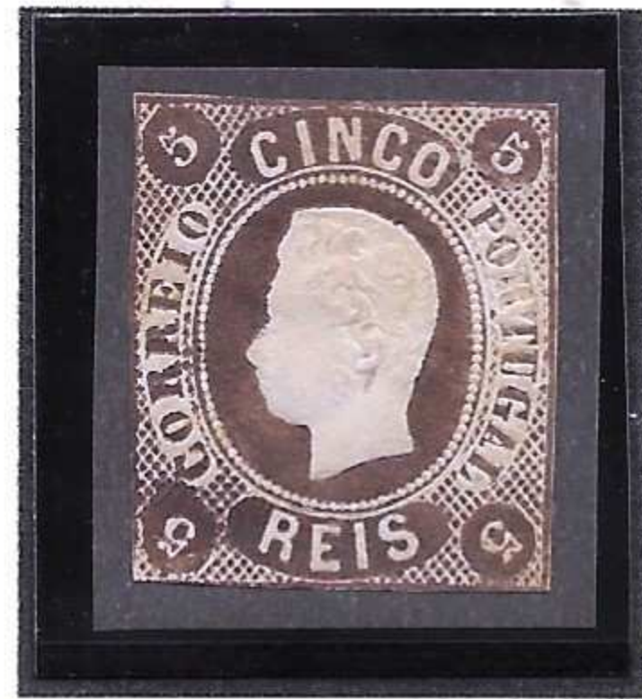
Dark Brown Proof