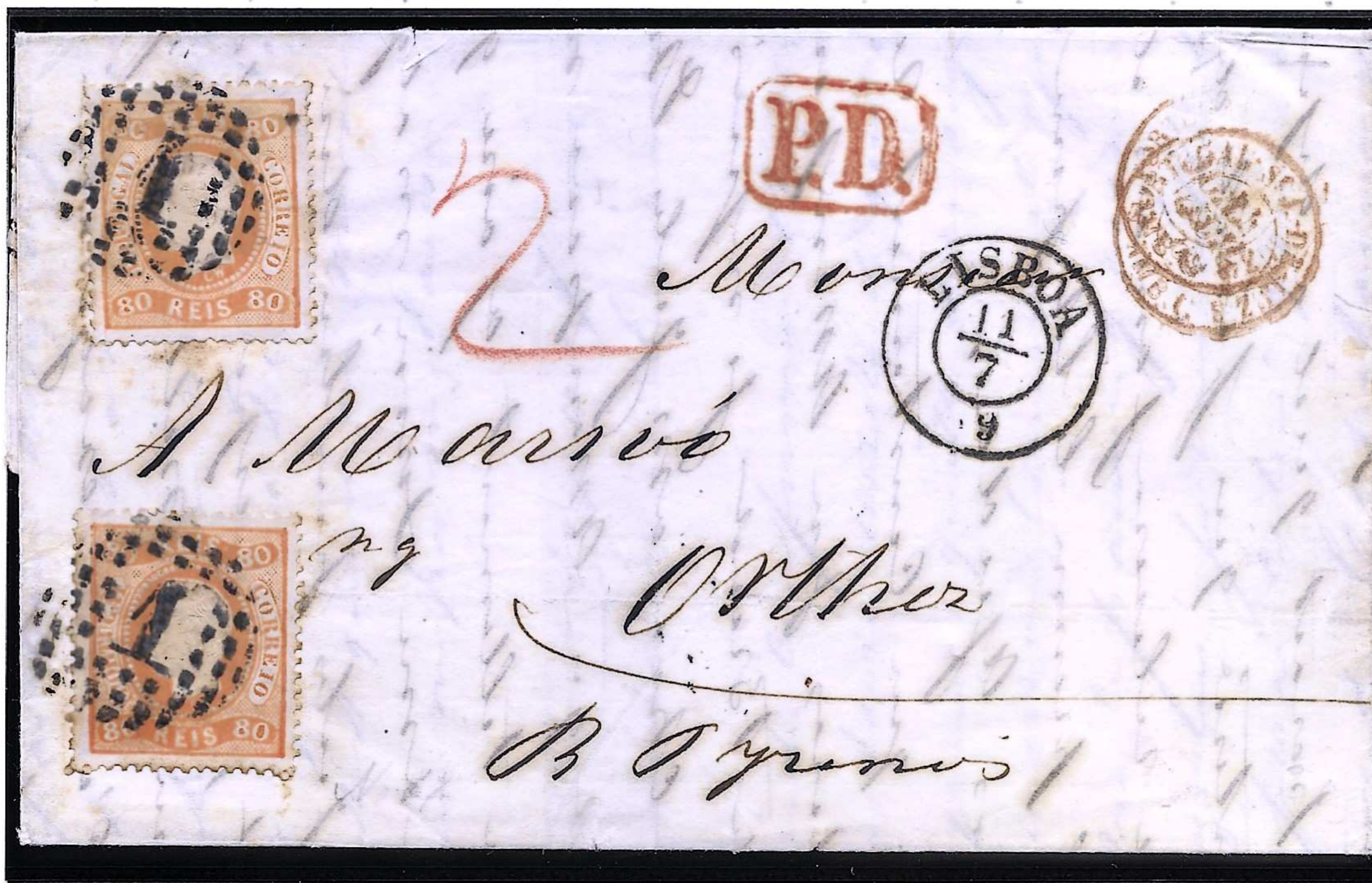
Folded cover sent from Lisbon to Orthez (France), on 11.7.1869, franked with two copies, obliterated with the "1" dots postmark of the first reform, from Lisbon, to pay the second rate to France of letters with weight between 10 and 20g.