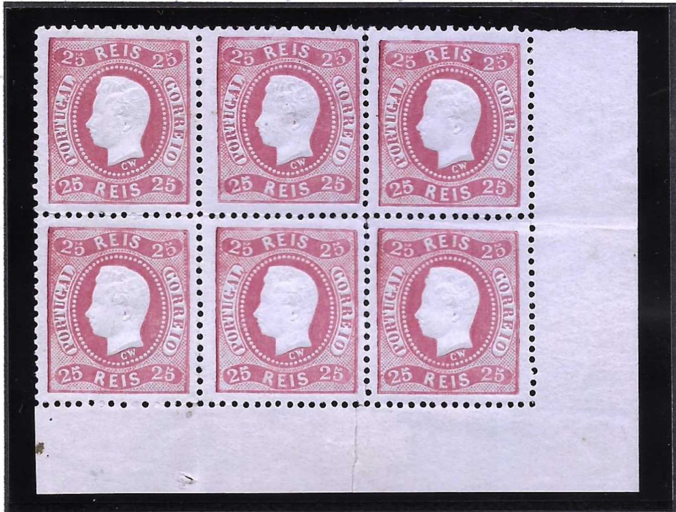
Block of six die I stamps