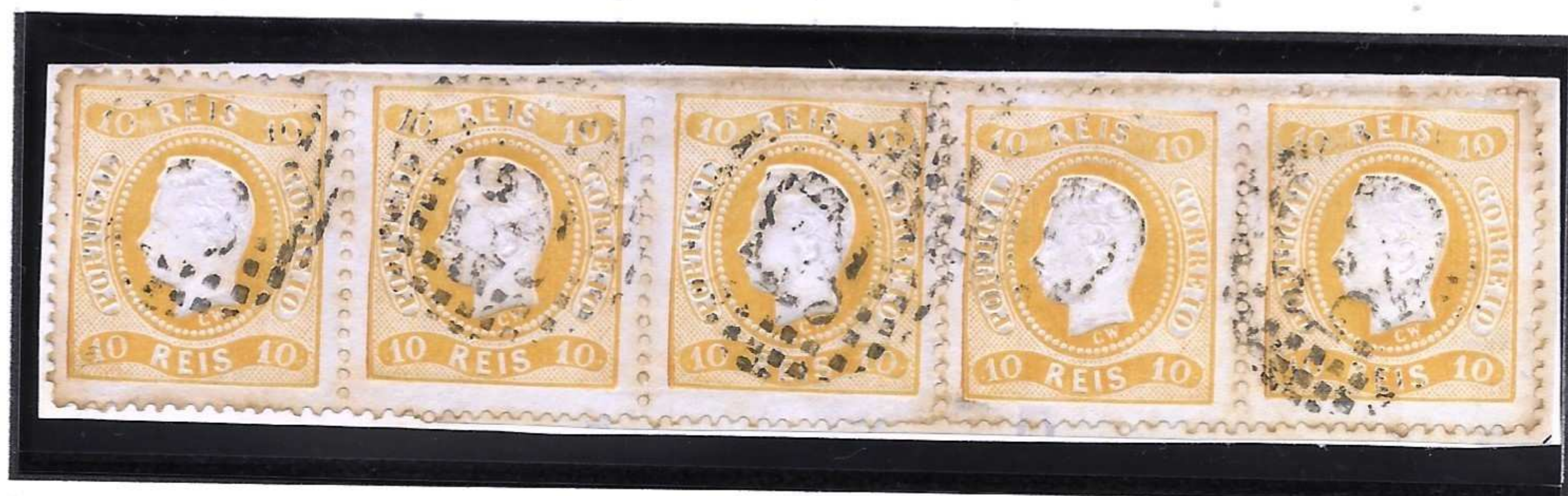
Strip of three and a pair, on piece, obliterated with "52" dots postmark of the first postal reform, from Porto