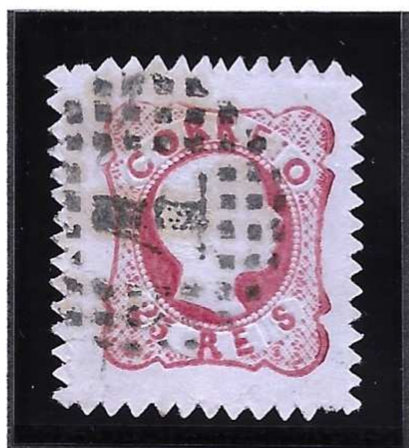
King Pedro V curly hair issue, 25 Réis Rose, zig-zag perforation from the Eisenach firm