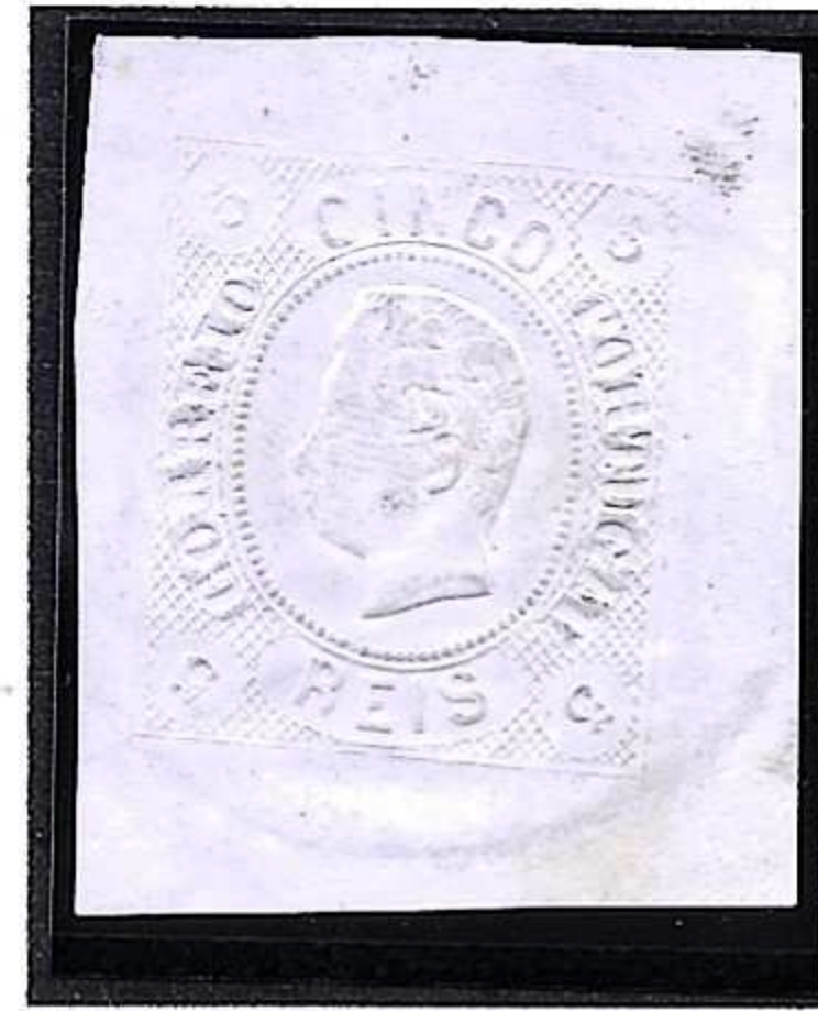
"Albina" or Dry Proof

COLOUR ESSAYS, APPROVED DESIGN, WITH "INUTILIZADO" SURCHARGE