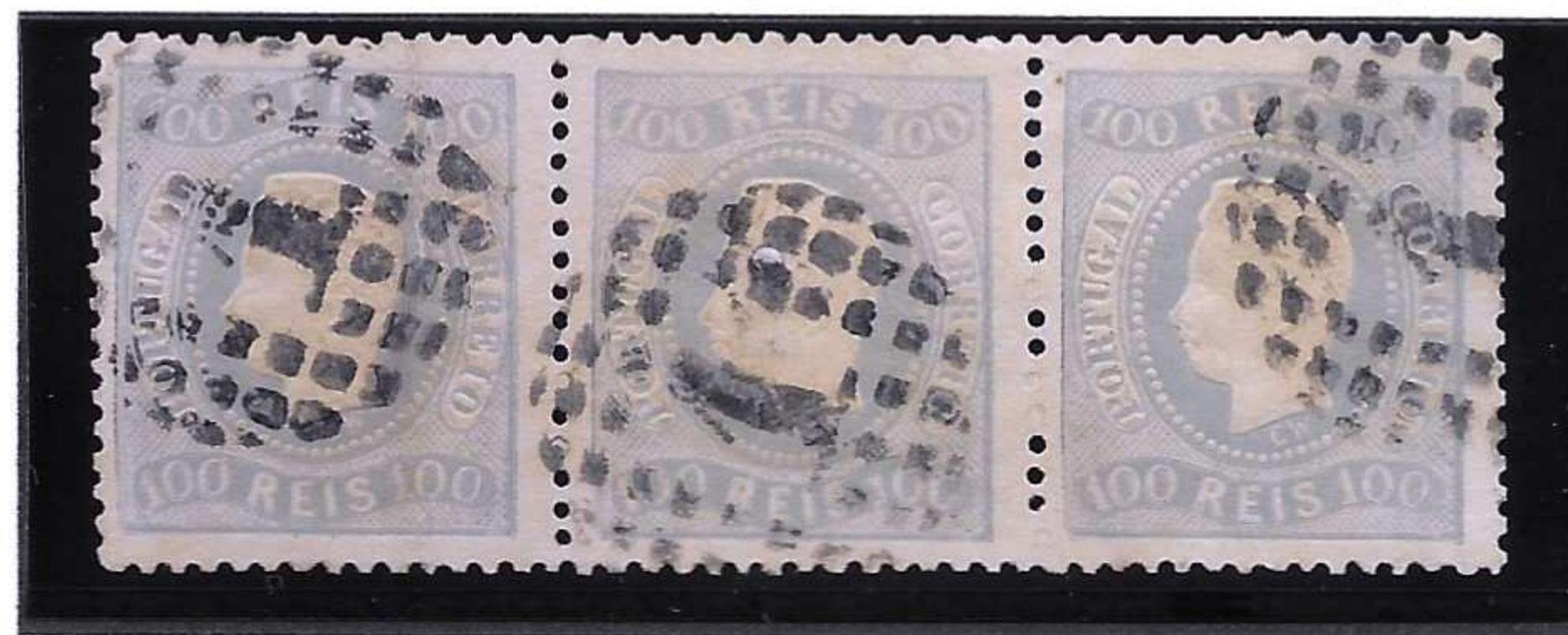
Die I horizontal strip of three stamps, obliterated with "1" dots postmark of the first postal reform, from Lisbon