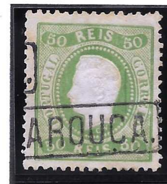
Copy obliterated with framed nominal "AROUCA" postmark