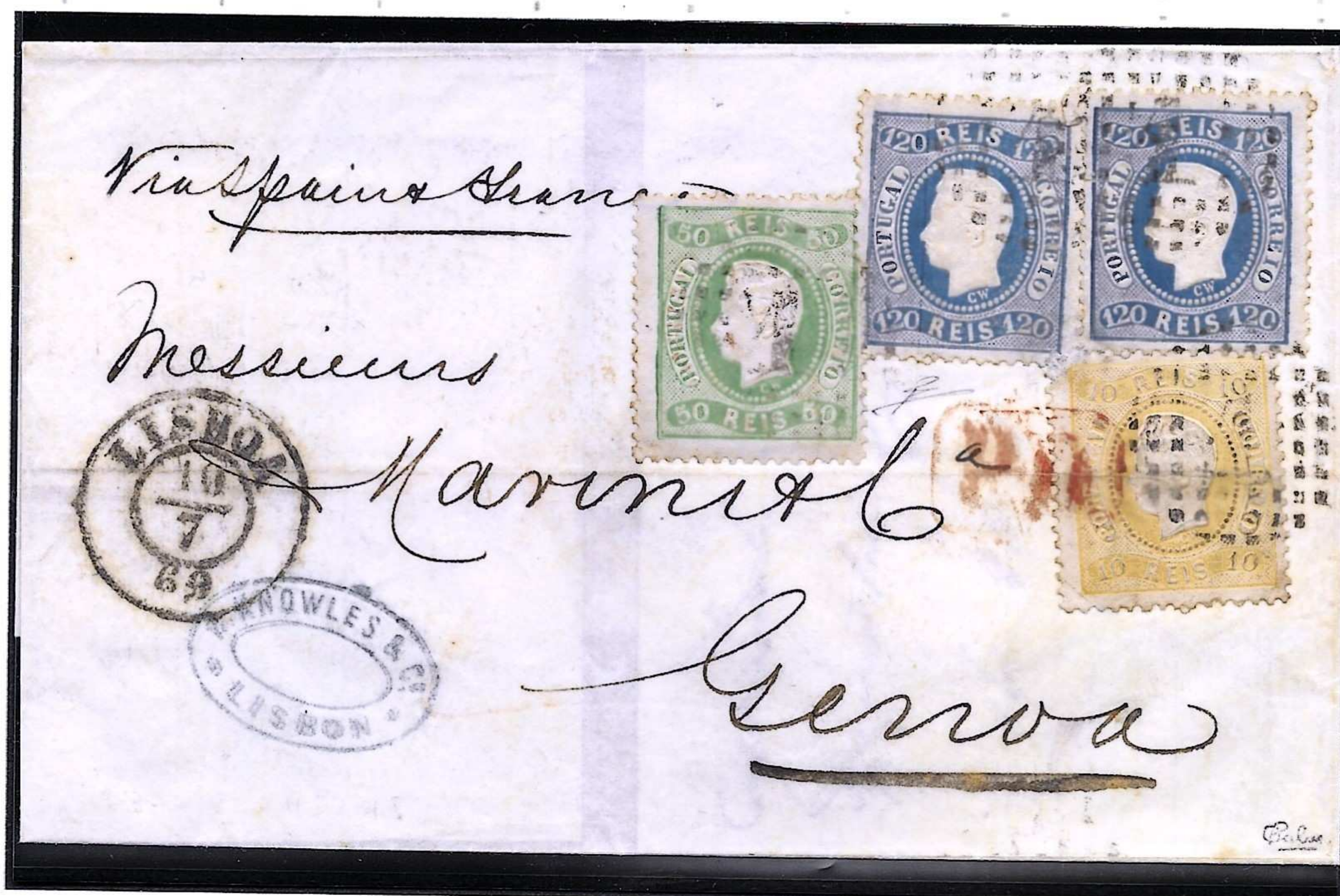
Folded letter sent by land from Lisbon to Genova, on 10.7.1869, franked with a 10 Réis copy, a single 50 Réis and two 120 Réis copies from the same issue, to pay the correct rate (300 Réis) of a double letter to Italy with weight between 7,5 and 15g. Stamps obliterated with "1" dots postmark of the first postal reform, from Lisbon.