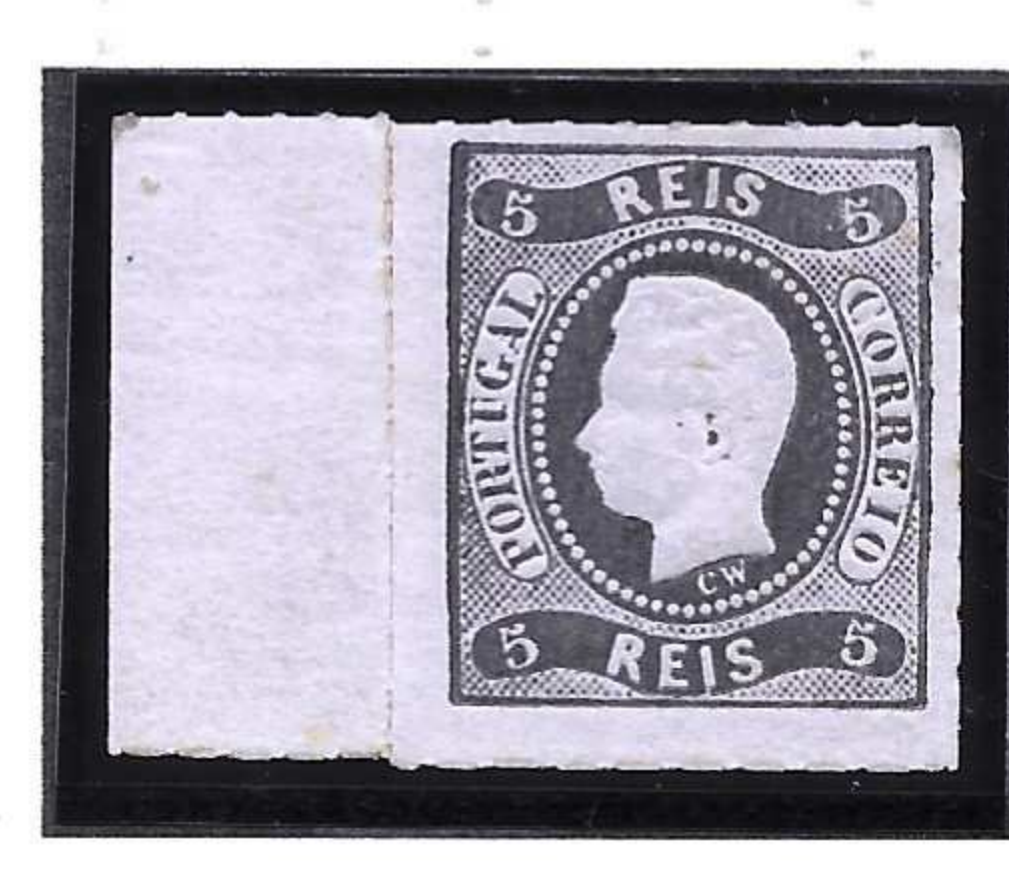
5 Réis Imperforated curved label issue, with line perforation from Madeira Island privates