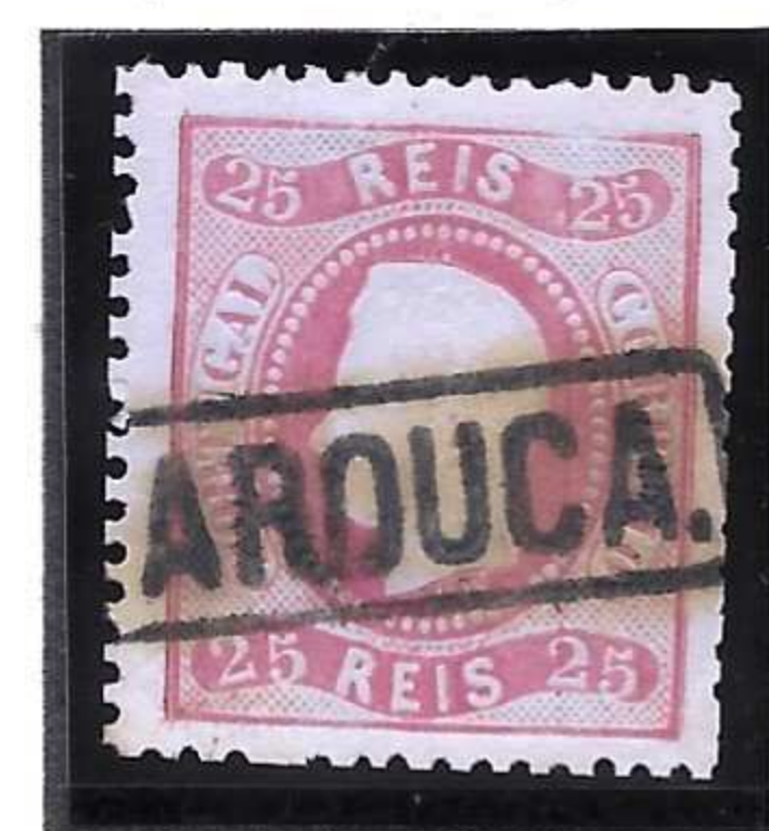
Die XIV, obliterated with framed nominal "AROUCA" postmark