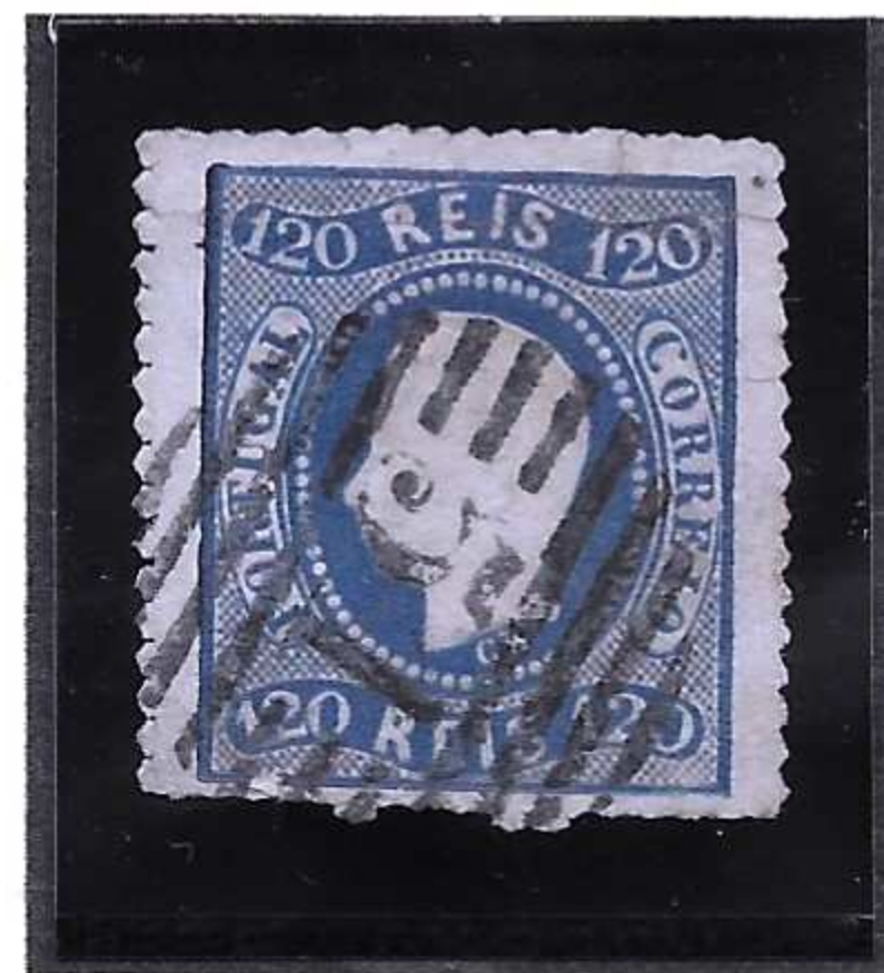
120 Réis Imperforated curved label issue, with "Percé en croix" perforation from Madeira Island privates