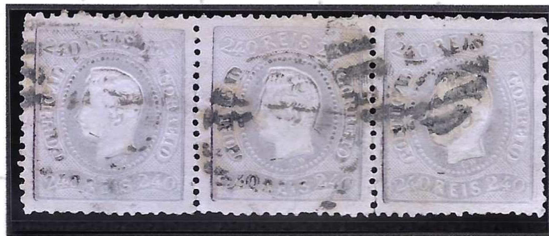
Horizontal strip of three, obliterated with "1" oval bar postmark of the second postal reform, from Lisbon