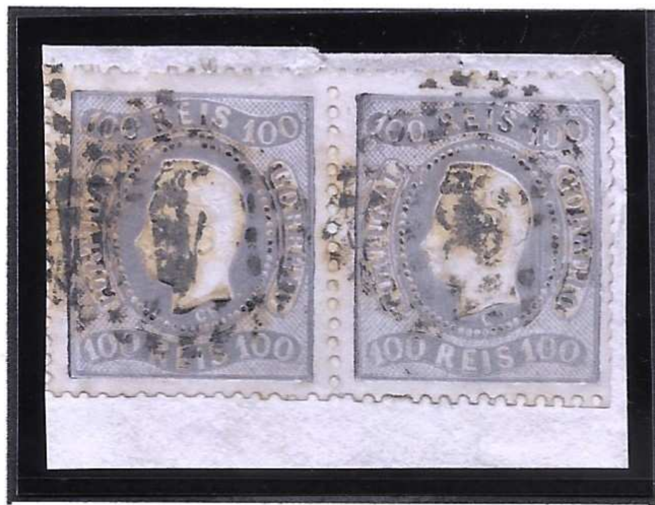
Die I horizontal pair on piece, obliterated with "1" dots postmark of the first postal reform. from Lisbon