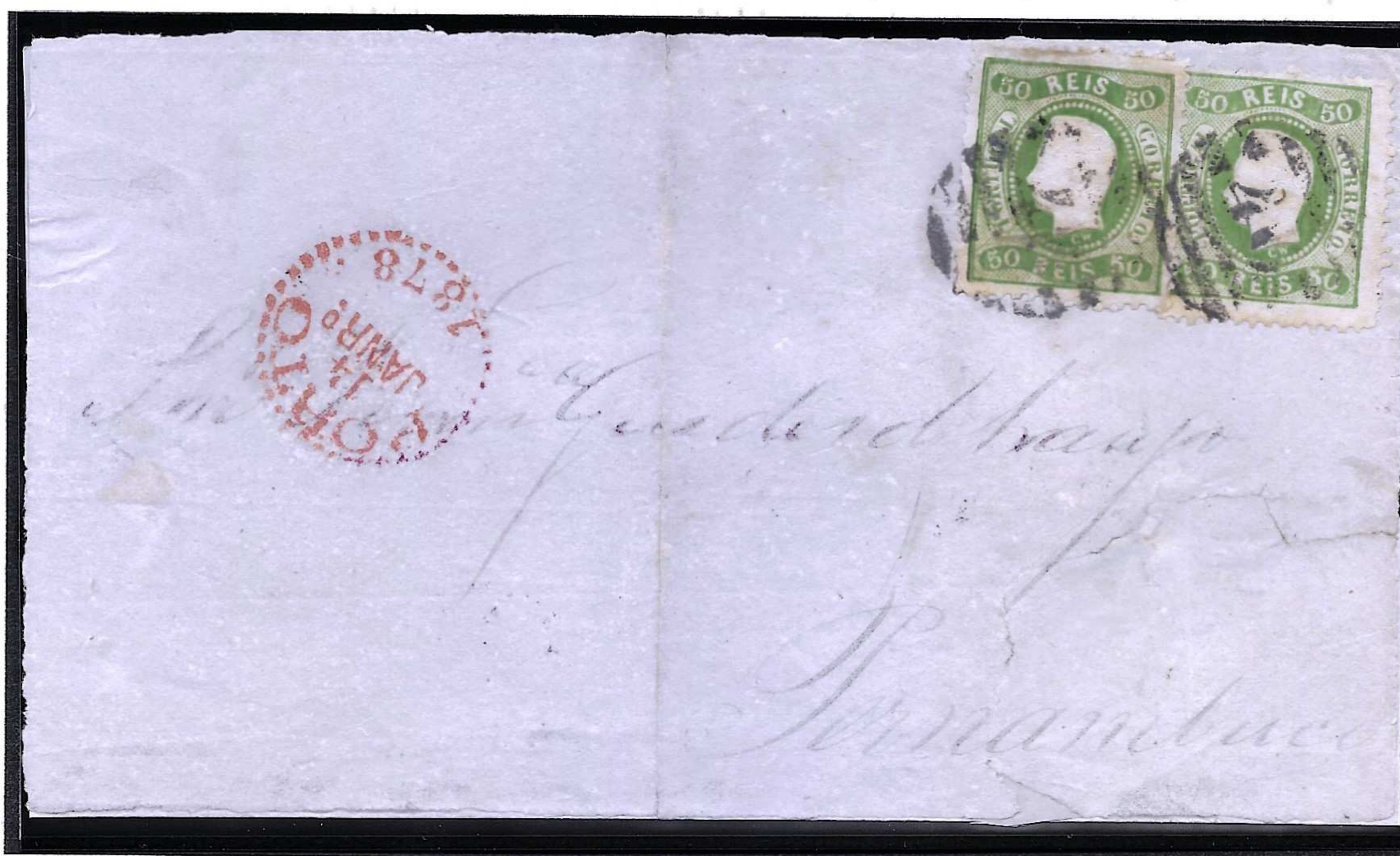
Front of folded cover sent from Porto to Pernambuco (Brazil), on 14.1.1878, franked with two copies, obliterated with "46" oval bar postmark of the second postal reform, from Porto, to pay the second rate to Brazil, for letters with weight between 15 and 30g carried by non-subsidized packet-boat.