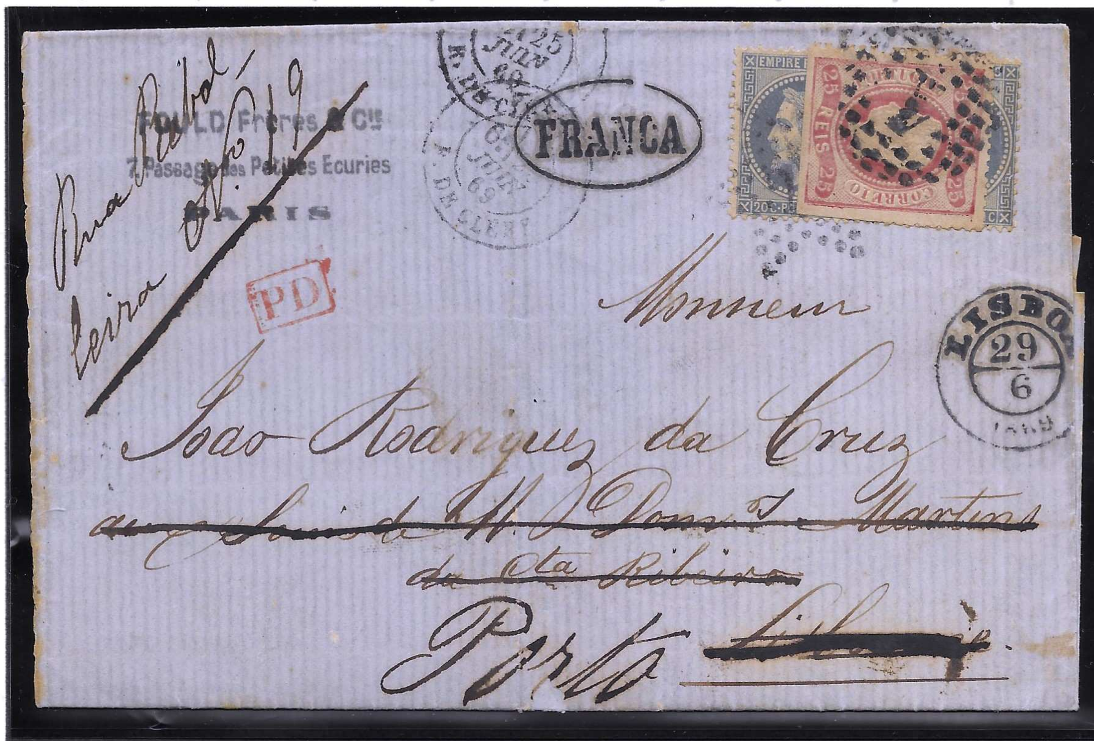
Folded letter sent from Paris to Lisbon, on 25.6.1869, franked with a pair of 20C blue Napoléon III, redirected to Porto with a die V copy of 25 Réis over the French stamps, obliterated with the "1" dots postmark of the first postal reform, from Lisbon to pay the first internal rate for weight up to 15g.