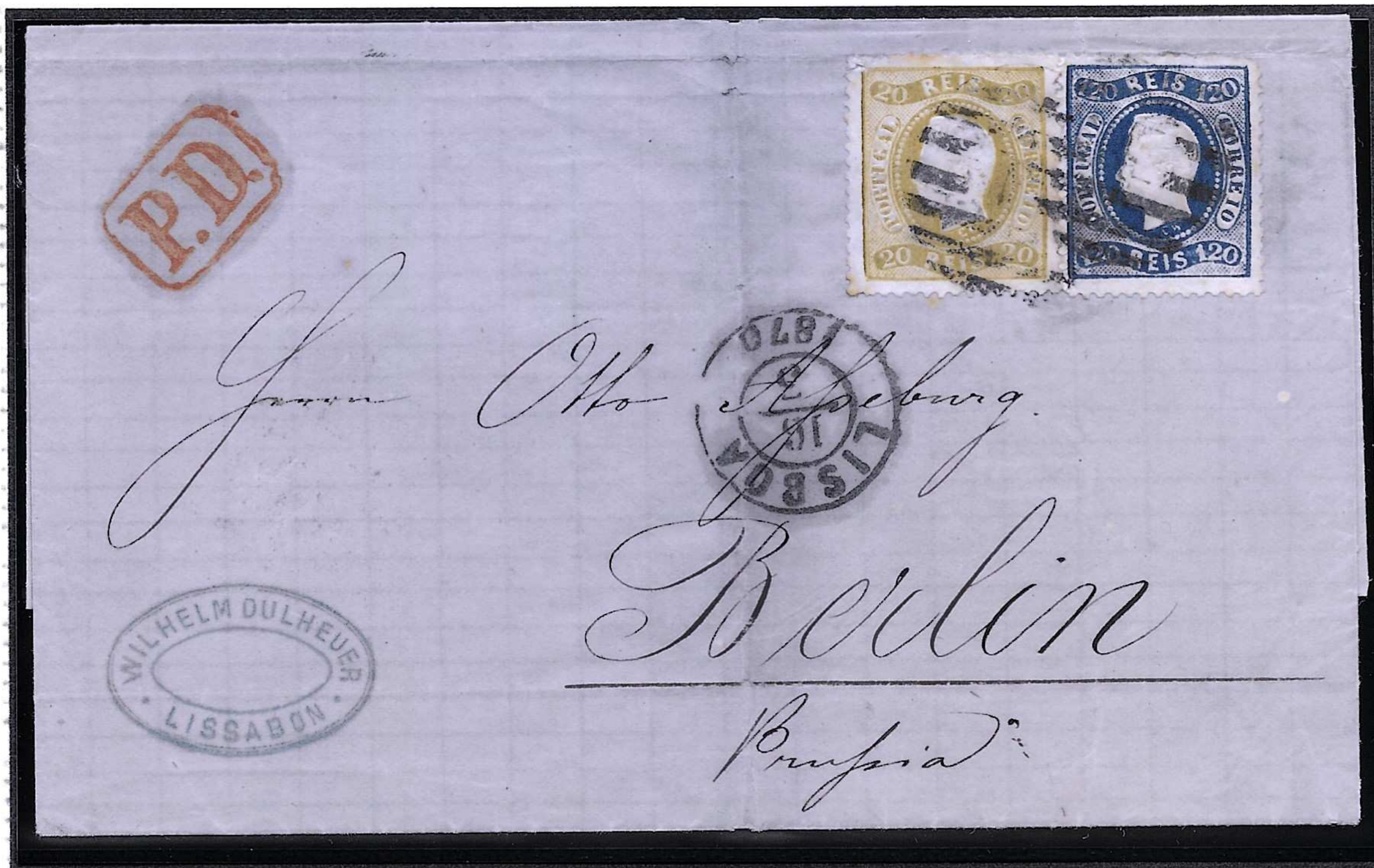
Folded letter sent from Lisbon to Berlin, on 16.3.1870, franked with 20 and 120 Réis copies, to pay the correct rate (140 Réis) of a single letter to Prussia with weight up to 10g. Stamps obliterated with "1" oval bar postmark of the second reform, from Lisbon.