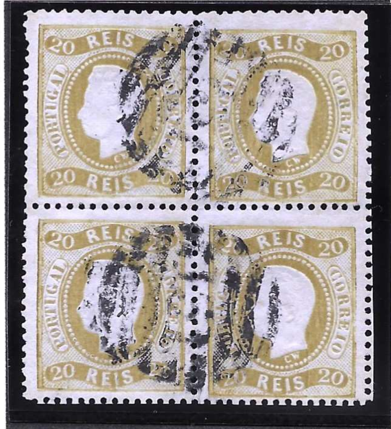
Block of four, obliterated with "131" oval bar postmark of the second postal reform, from Almeida.