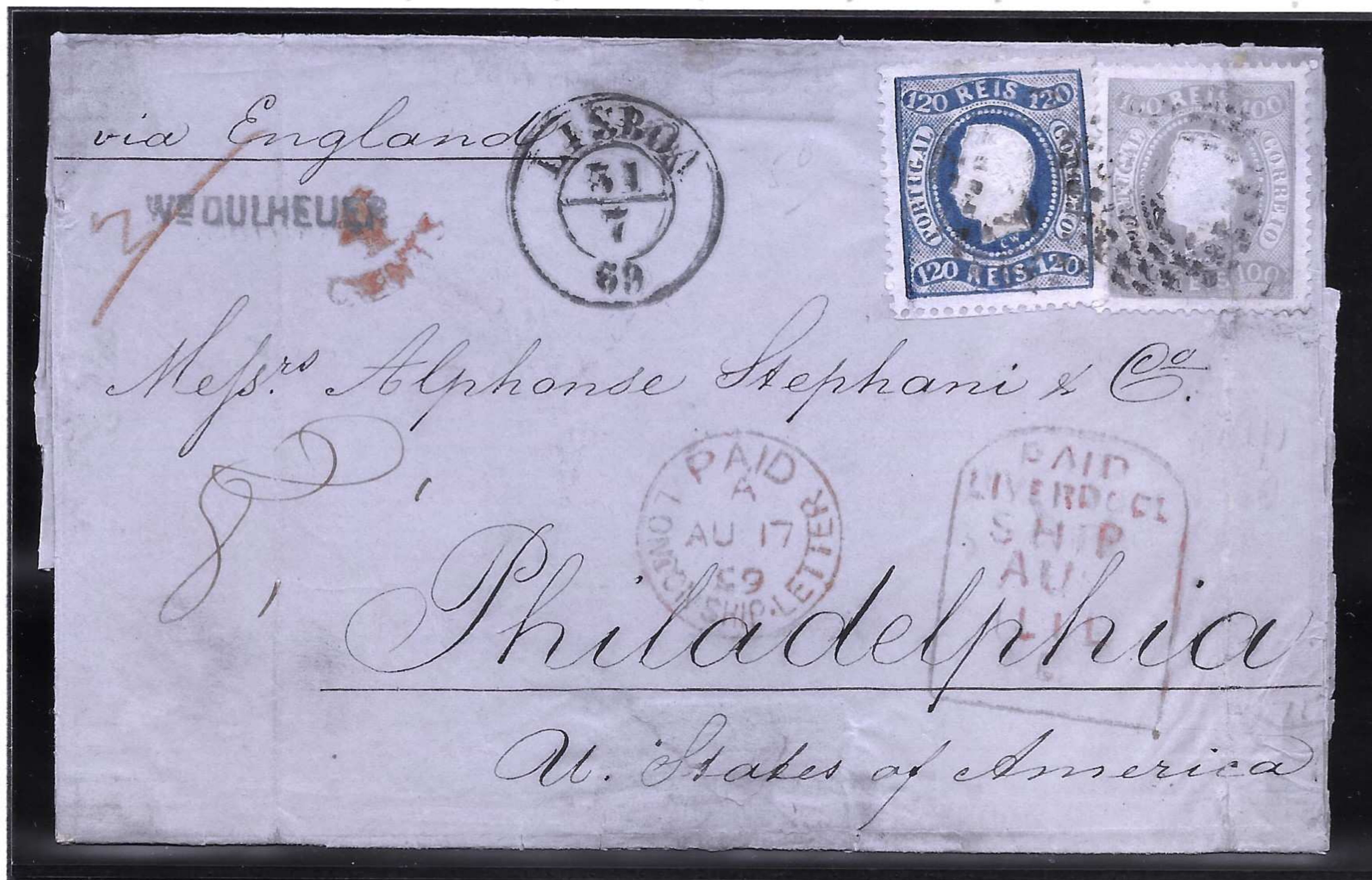
Folded letter sent from Lisbon to Philadelphia (USA), by London and Liverpool, on 31.7.1869, franked with copies of die II 100 and 120 Réis from the same issue, obliterated with "1" dots postmark of the first postal reform, from Lisbon, to pay the single rate of a letter to USA with weight up to 7,5g.