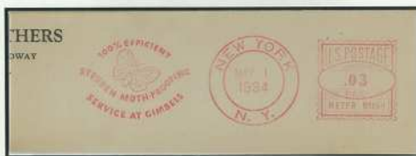
The body of a thick and fat moth

Chestnut moths are found everywhere in the world, and their wings are covered with scales such as powder or dust.