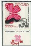
Damage from pollution

Recently, as humans' agricultural, industrial, and urbanization work has accelerated, air and water pollution and climate change have led to a decrease in habitats, which are pointed out as a direct factor in the extinction of insects such as moths.