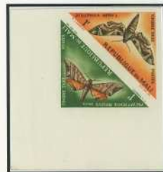
Mall final stag pleat proofs block with imperforated

Noctuidae moth is sucking the nectar from the flower