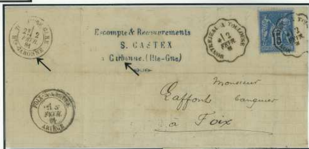
The absolute age of relics and remains was measured using radioactive carbon isotopes (Carbonne). - France Foix Carbonne postmark (21. 2. 1884) -