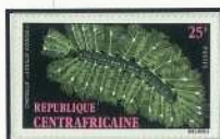
At the tip of the caterpillar's horn, there is a microscopic toxic substance that protects itself from predators.