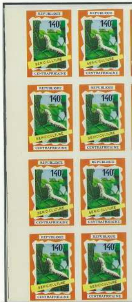
Cocoon providing silk - Proofs -