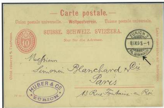
Postmark with SEIDENGASSE = Silk Industry 08th Oct 1905 send to Zurich h Switzerland was named after silk, and it is still the largest producer of silk to this day.