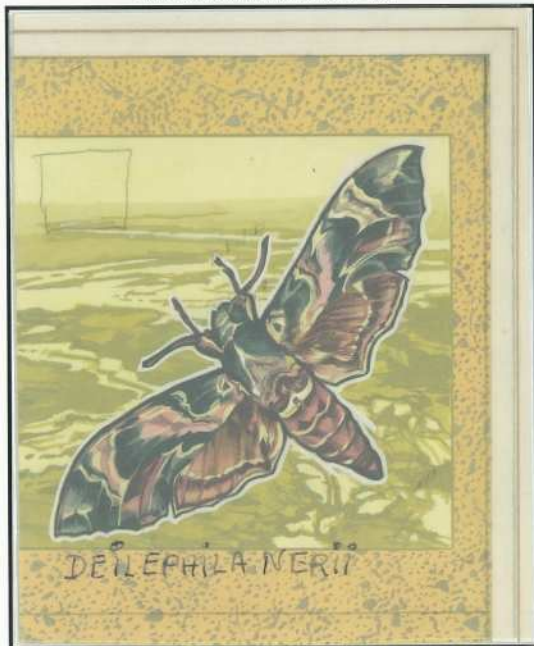
Original artist hand artwork adopted with Autograph (MALI Noctuidae Original)

The tendency to fly toward the candle is not because of the liking of fire, but because of the nature of flying while maintaining a certain angle toward the light. - England advertising stationery 1890 -