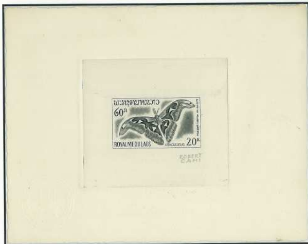
The tip of the snake-eye moth resembles a snake's head and uses a camouflage technique that protects itself by mistaken it for a snake from natural enemies. - The copy for this final stage proof to check the black colour file copy for the engraver Robert Cami -