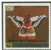
Snake-eye moth's to protect themselves from natural enemies