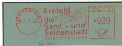
Meter stamp Germany illustrated with silk KREFFID

The silk provided by the silk moth has become a commodity that not only the nobles but also the common people can enjoy. - Merle Advertising Stationary 1940 -