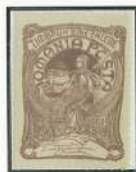
Silk thread drawing and weaving