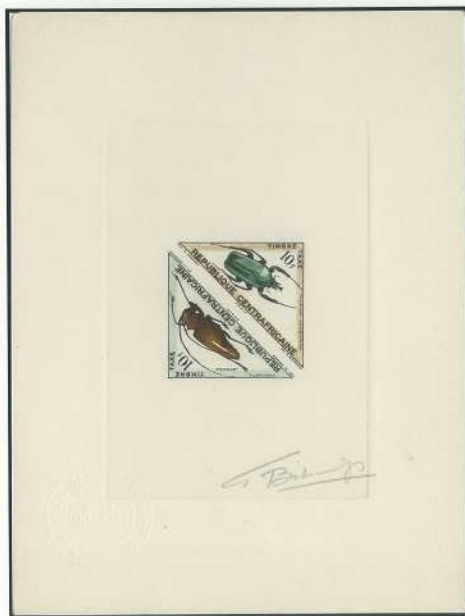
Insects such as stinkbugs and beetles have a habit of feeding on moth larvae. - Dia proof with signature of engraver S. Bhis (1862) -