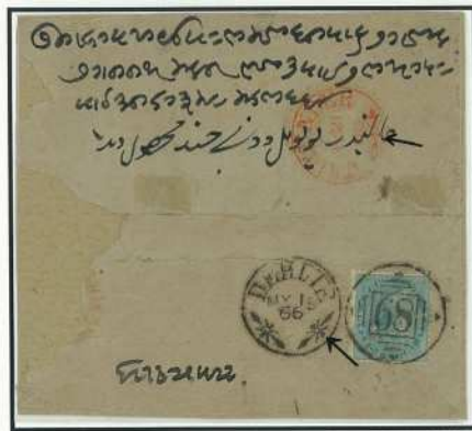
India's Amritsar and Nawalpurh Moth postmark of 1866, black in DEALTE '68' A real envelope with a postmark and JLTUTER's red postmark