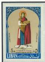
The first introduction of silk to Europe Alexander the Great