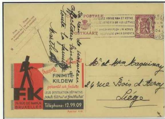
A lot of insect repellents were sold to reduce the damage of pest moths. - Belgium Advertising Stationery 1936 -