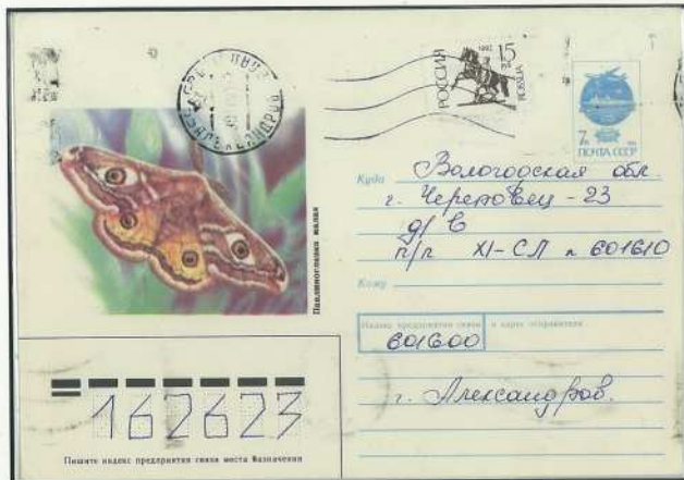
As a defense against natural enemies, moths have a body color that resembles nature or have poison on the body. In general, poisonous moths are vivid in color.