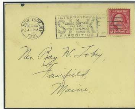
The International Silk Expo held in New York, USA in 1922, participated in the production of inexpensive and high-quality fabrics, contributing to popularization. - 1922 New York Silk International Exhibition Memorial -