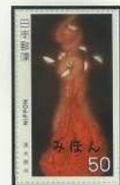
Moths have a habit of gathering on lanterns at night.