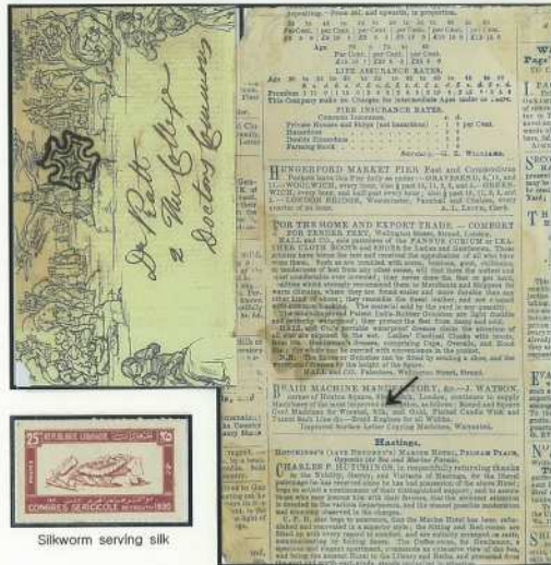
Silkworm serving silk.

The silk provided by the silk moth has become a commodity that not only the nobles but also the common people can enjoy. - Merle Advertising Stationary 1940 -