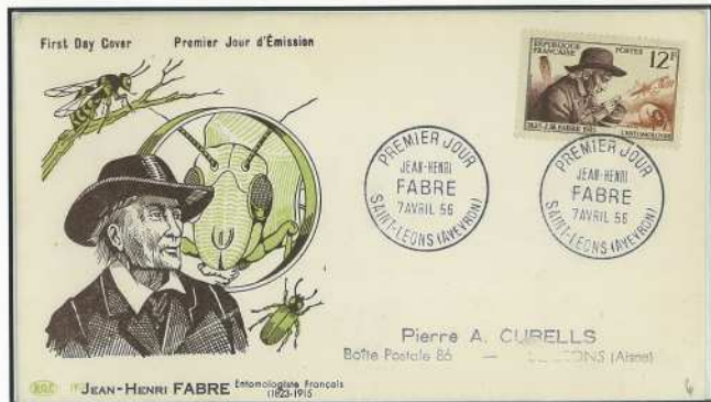
Fabre observes a moth with a magnifying glass.

This is an Essay published in France on April 7, 1956, with the design of the entomologist Fabre, who observes the movements and moths of mantis, cicadas, and dung beetles through a magnifying glass.