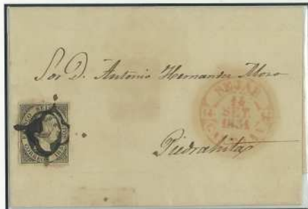
Spiders web fancy stamp used for cancellation in Spain (it was used for about a year and a half from 1860 to 1861) - Spain 1860 cancellation of spider web send to Broodstone -