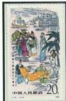
Chinese silk, along with ceramics, was a major trade.