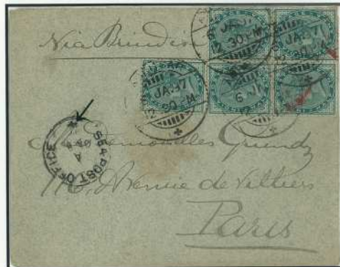
Marseille in Paris, France with a moth postmark from a maritime post office issued by the East India Company in 1897. It is a real envelope sent to Bombay, India.