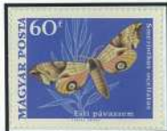
Fur to protect yourself from natural enemies