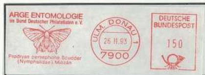
Entomological Society Commemorative postmark

The first moth fossils appeared in 1.4 million years, but primitive moths appeared in the middle of the Mid Carboniferous.