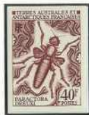
Primitive moth - color proof -

Moths are said to have evolved by differentiation from the common ancestors of primulas and adults. Early known moth fossils are known between 400,000 and 500,000 BC (Coal Age), and this may be an ancient creature.