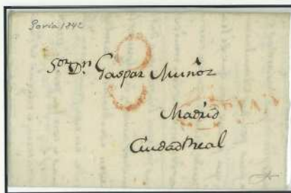
1842 cocoon Fancy Envelope sent from Sorea to Ciudad Real