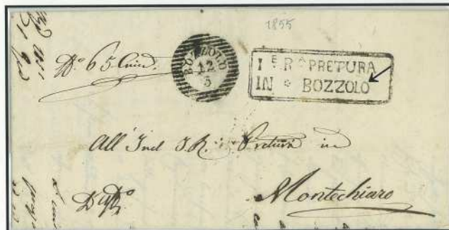
Italy 1955 Postmark of "BOZZOLO" is mean in English COCOON # "BOZZOLO" Silkworm skewers in English as COCOON.