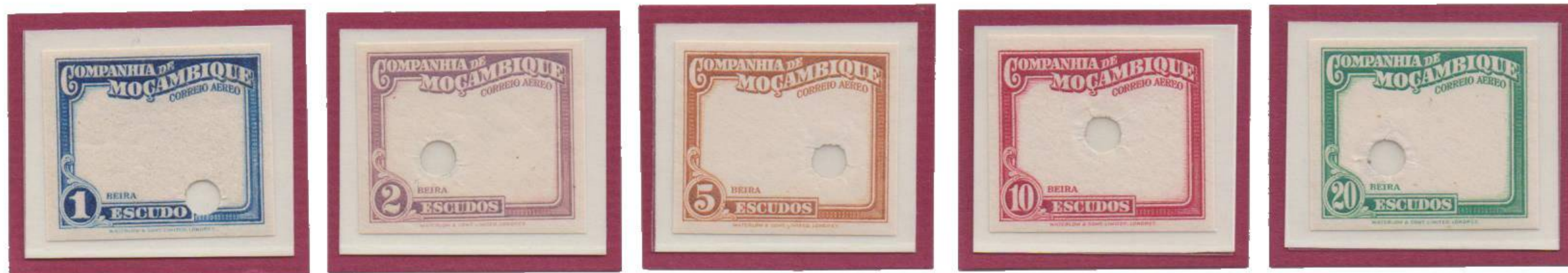
FRAMED IMPERFORATE PROOFS WITH VALUE, ISSUED COLOURS AND SECURITY PUNCH HOLES.