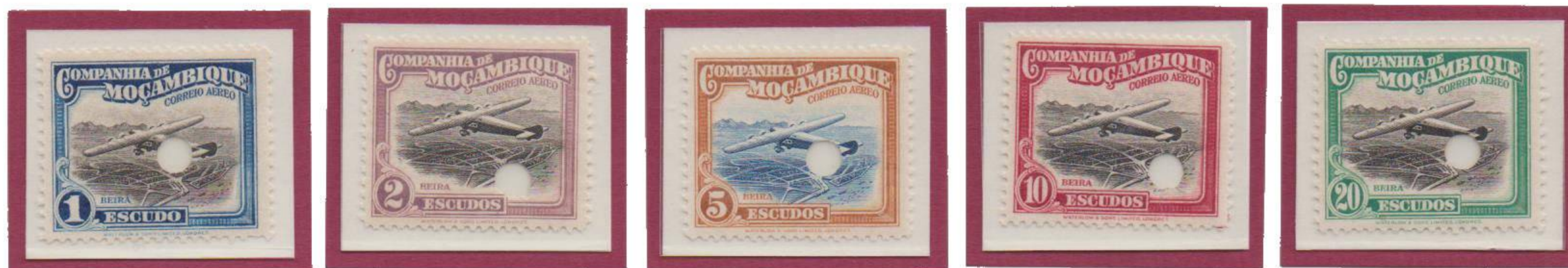
PERFORATED PROOFS WITH VALUE, ISSUED COLOURS AND SECURITY PUNCH HOLES.