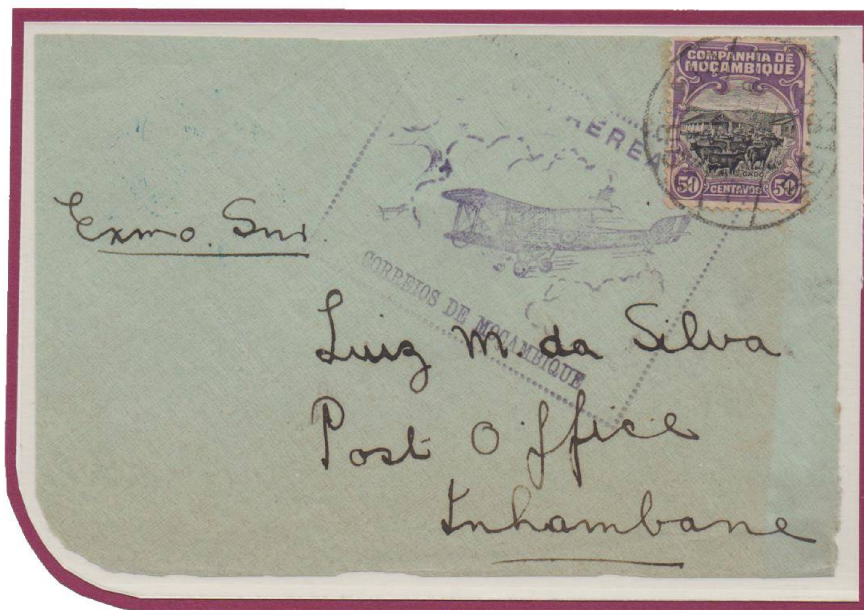
FRONT PART OF COVER FROM BEIRA TO INHAMBANE, FRANKED WITH 1925 ISSUE 50 CENTAVOS. TIED WITH VIOLET CACHET.

ON AUGUST 16 TH 1929, THE LOURENÇO MARQUES AERO CLUB SENT THEIR 'DH MOTH' ON A SPECIAL FLIGHT TO INHAMBANE (250 MILES NORTH UP THE COAST) WITH MAIL. NO ADDITIONAL AIR FEE OR LABELS WERE REQUIRED. THE LETTERS WERE FRANKED AT THE RATE OF 50 CENTAVOS. TO COMMEMORATE THE OCCASION A PICTORAL CACHET WAS FABRICATED BY MINERVA CENTRAL IN LOURENÇO MARQUES, DEPICTING AN AEROPLANE 'VIA AÉREA' INSCRIBED 'CORREIOS DE MOÇAMBIQUE'. THE CACHET WAS APLIED IN PURPLE AT LOURENÇO MARQUES AND IN RED AT INHAMBANE FOR THE RETURN FLIGHT, WHICH WAS UNDERTAKEN ON AUGUST 21 ST . THE NUMBER OF LETTERS CARRIED IS UNKNOWN BUT VERY FEW HAVE SURVIVED. 'PORTU - INFO' VOL. 37 # 144.