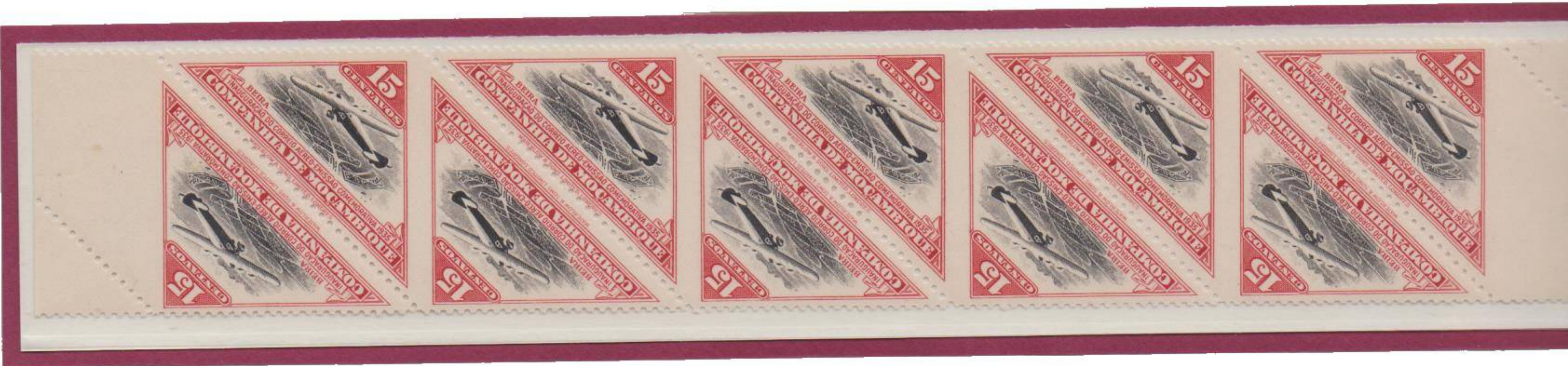
VARIETY IMPERFORATE BETWEEN