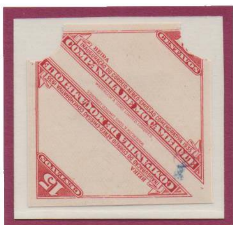
FRAMED IMPERFORATE PROOF