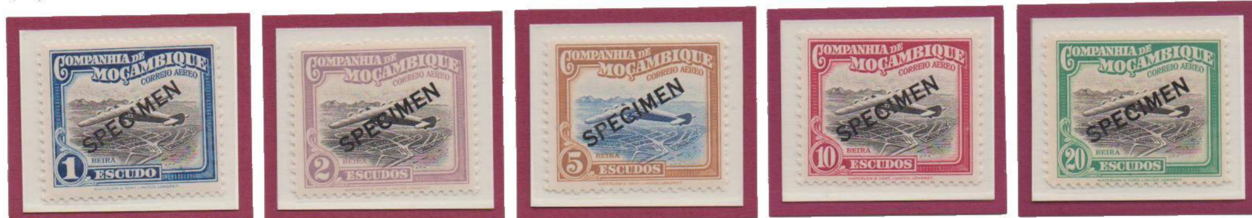
ISSUED STAMPS OVERPRINTED 'SPECIMEN'