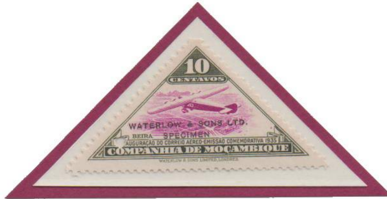
TRIAL COLOUR 'SPECIMEN'