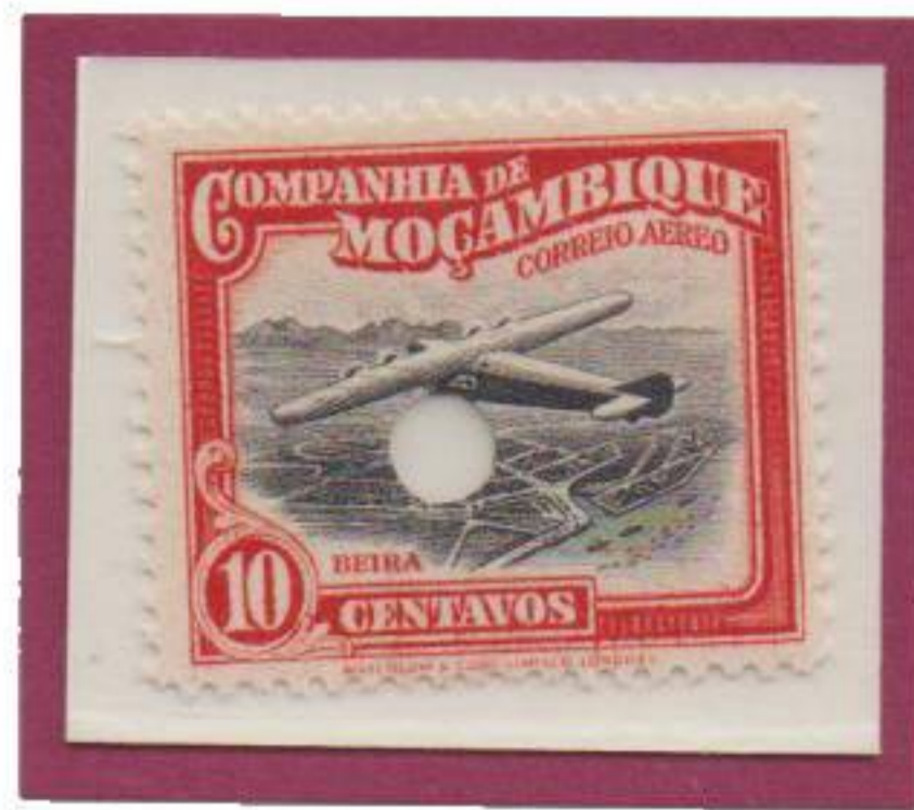
PERFORATED (e) PROOF