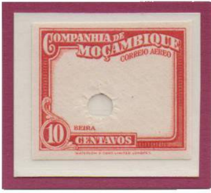
FRAMED IMPERFORATE PROOF