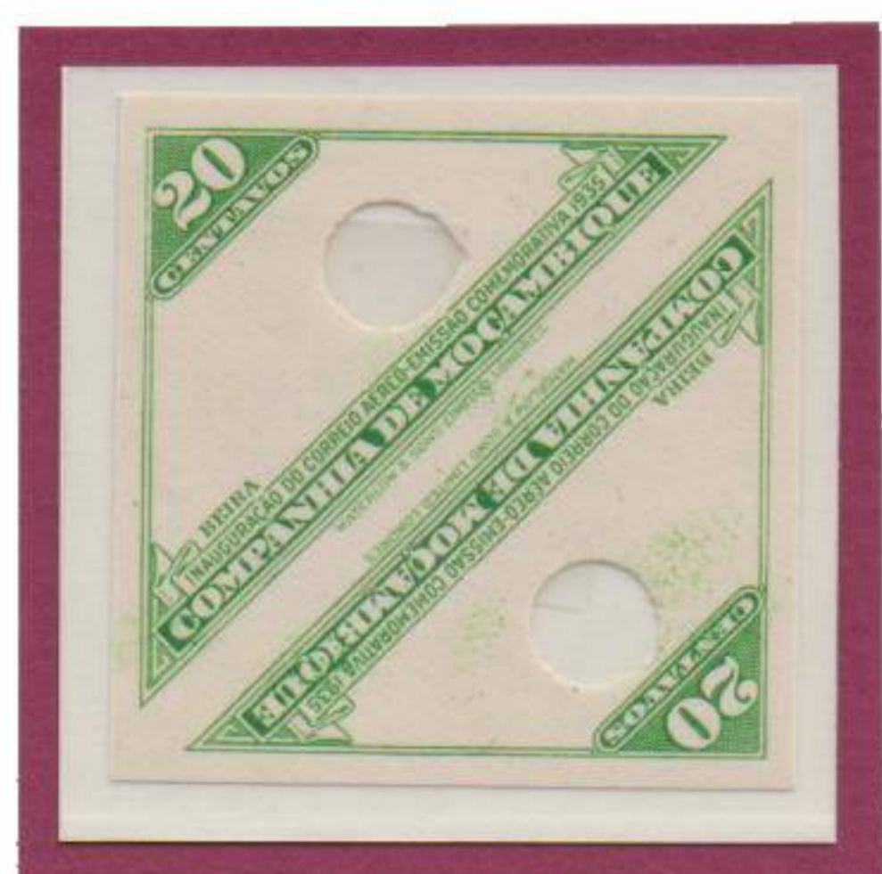
FRAMED IMPERFORATE PROOF