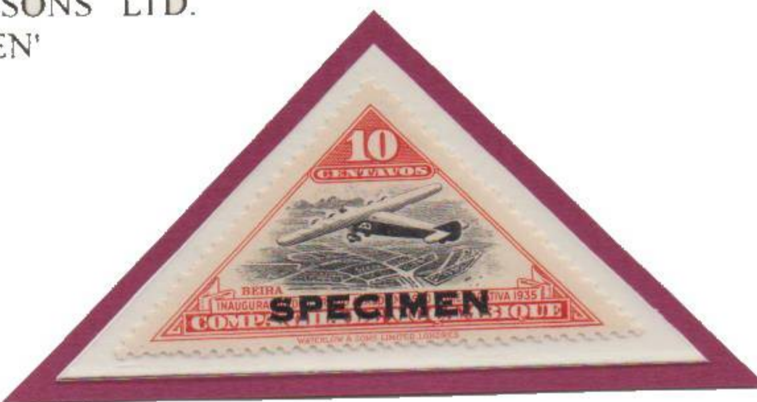
OVERPRINTED 'SPECIMEN' MEASURING 21 1/2 BY 2 1/2