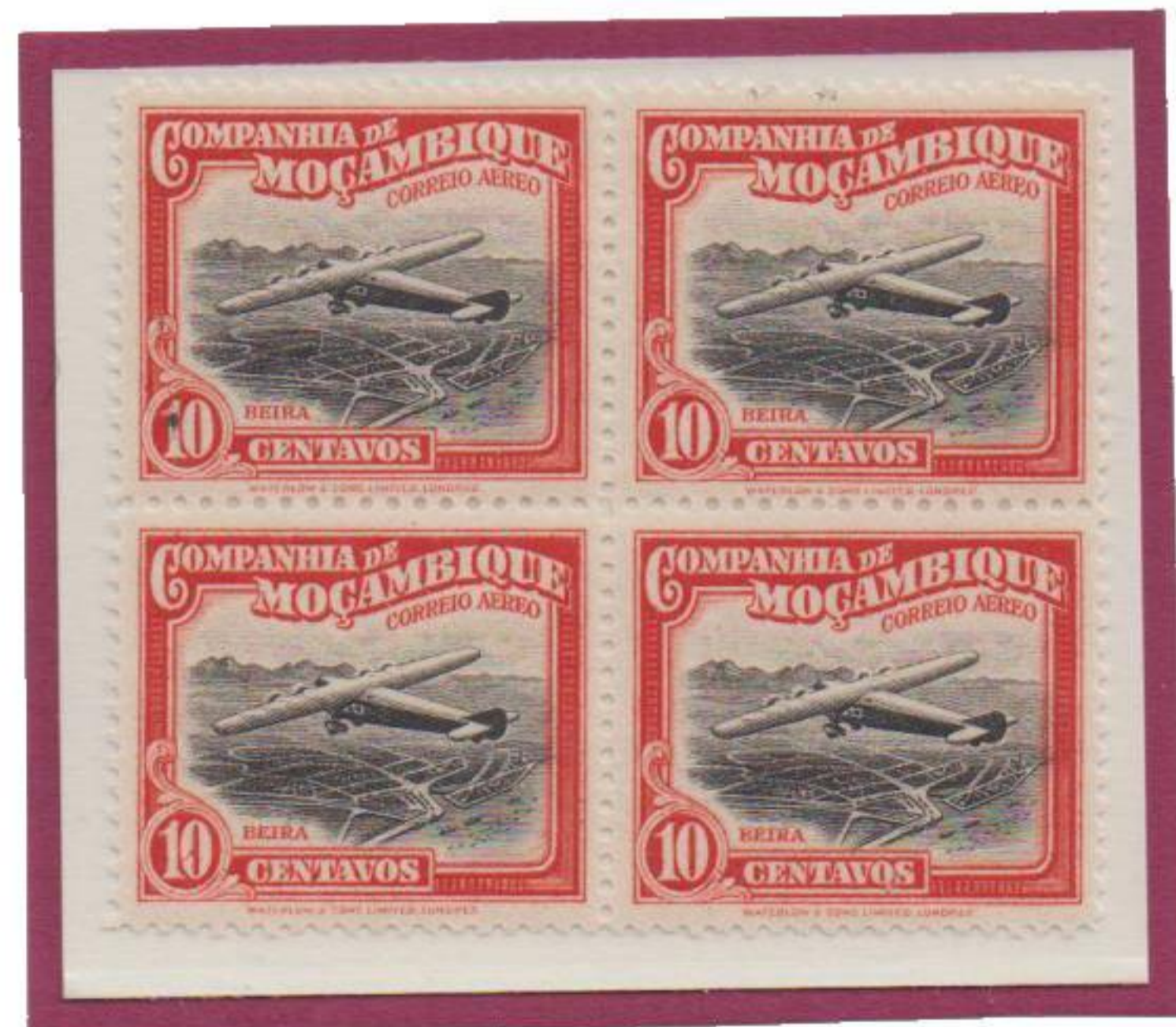
VARIETY IMPERFORATE BETWEEN