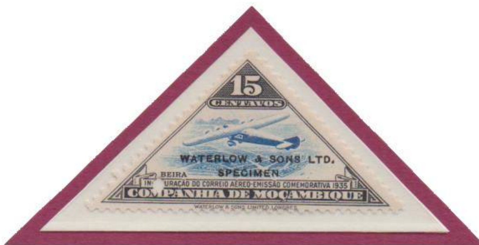
TRIAL COLOUR SPECIMEN

'ARMSTRONG - WHITWORTH ATALANTA AIRLINER' OVER BEIRA