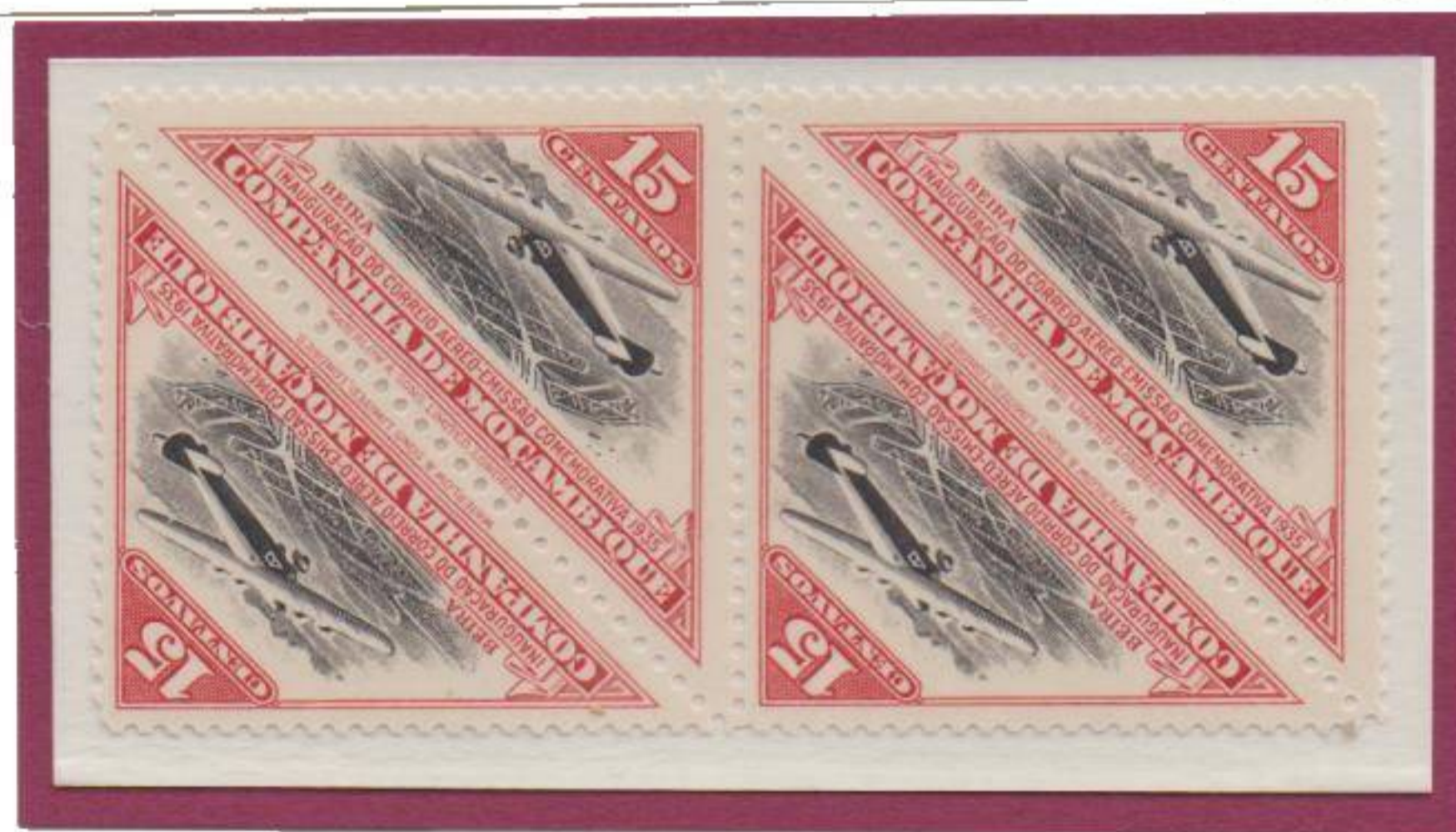
TETE - BECHE 15 CENTAVOS