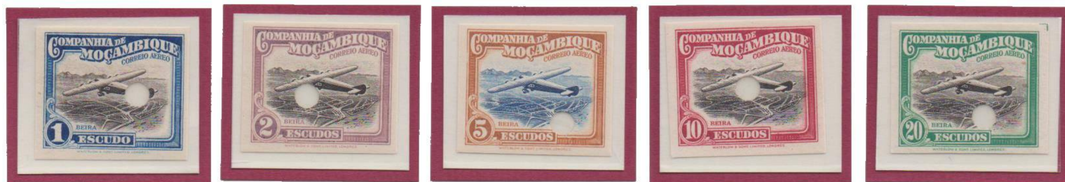
IMPERFORATE PROOFS WITH VALUE, ISSUED COLOURS AND SECURITY PUNCH HOLES.