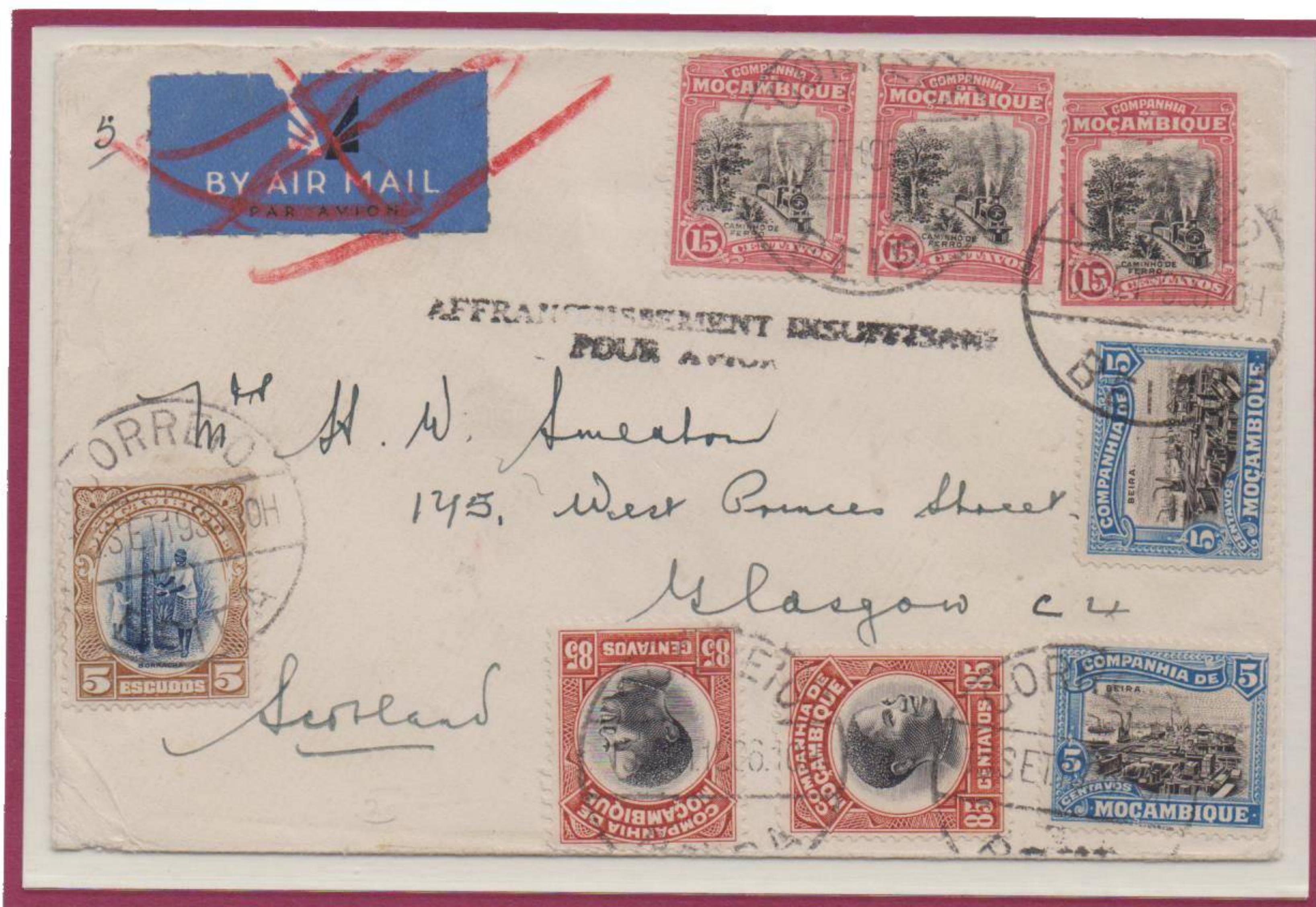
1936 SEPTEMBER 15TH. FRANKED WITH DOUBLE 5 CENTAVOS, TRIPPLE 15 CENTAVOS, DOUBLE 85 CENTAVOS, 5 ESCUDOS.