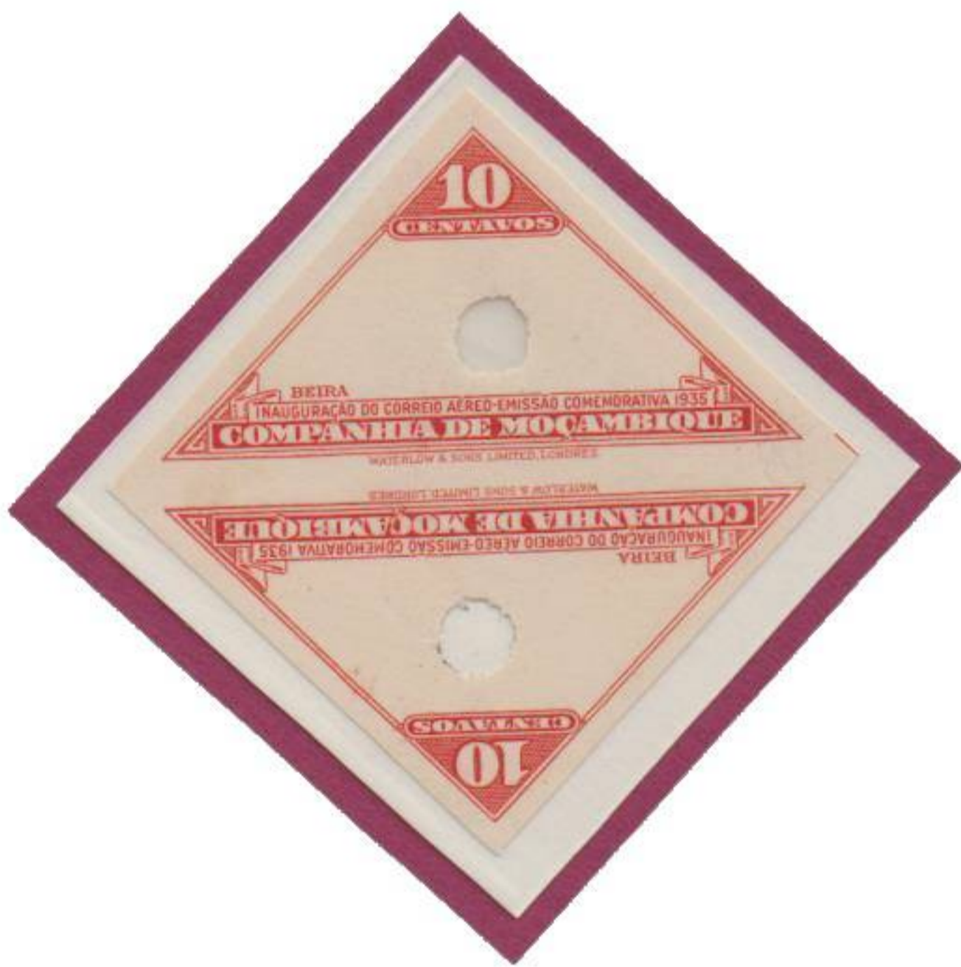
FRAMED IMPERFORATE PROOF