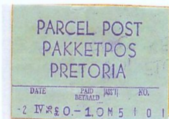
Fig.1 First experimental parcel label

Only a single loose tape/slip is known to have survived, photo shown in Fig 1. as a borderless frank with a large "PARCEL POST / PAKKETPOS" / "PRETORIA" in top half. Below "PRETORIA" is a line across the stamp with "DATE" "PAID/BETAAL" "ASS'T" / "NO". Along the bottom are the date, value figures, "M5" (clerk identification), and a 3-digit transaction number. It is printed in violet on green paper. One machine is known used experimentally. Strangely it is dated 2 IV 1936 although the announcement was made in 1935, and green paper was used not yellow.