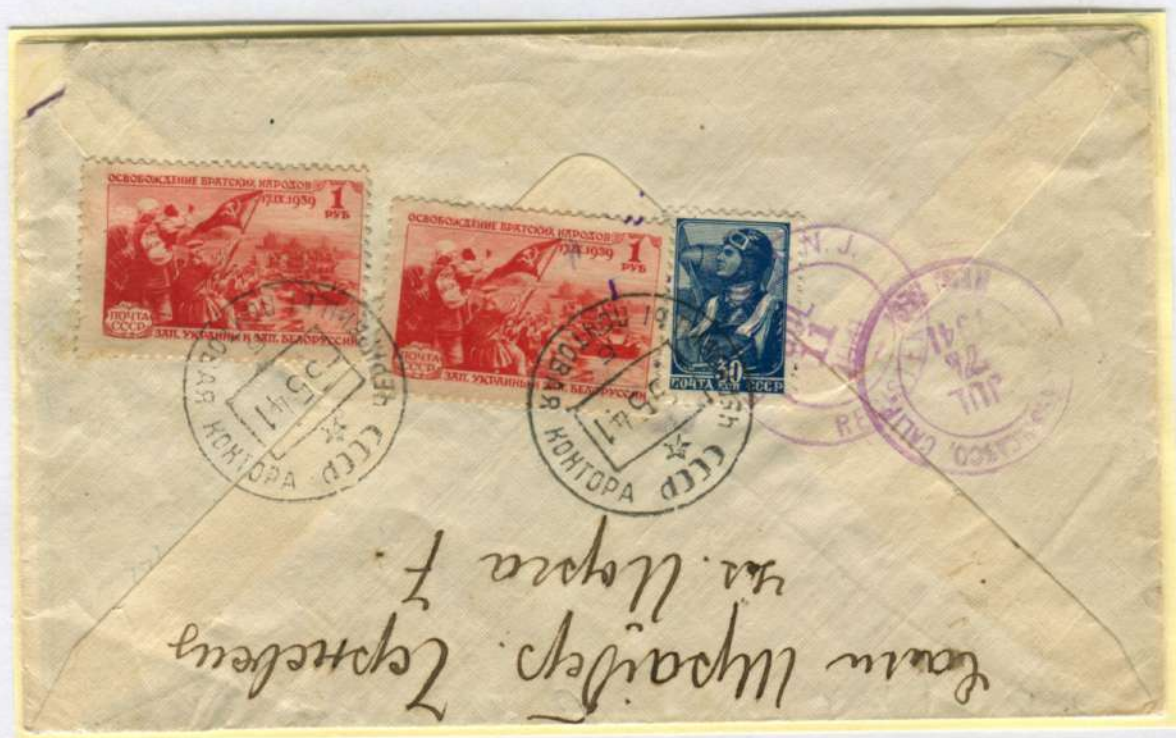
Registered postcard sent on 21.05.41 from Chernivtsi via Kiev-Moscow-Baku- Tehran-Basra in Bahrain, arrived 28.09. The postcard passed many censors of different countries. The censorship has peeled off the 50 kopeck stamp - in its place is the arrival stamp. The text is in Yiddish. The only air correspondence from the territory of Ukraine to Bahrain described in the literature.

Rate of 1.05.36. International mail. Registered airletter 2 rub. 30 kop. Correct payment.