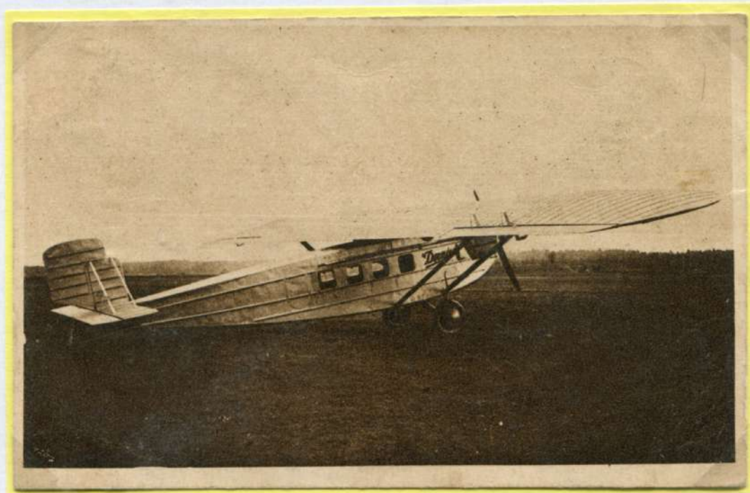
Soviet postcard twenties, calling to contribute to the construction of aircraft Osoaviakhim.

The air network in the Ukraine region expanded rapidly during the early 1920s and late 1940s as the importance of air communication was recognized by the public, governmental and commercial enterprises. Ukrvozdrukput' airways absorbed the Zakavia airline and expanded its routes throughout the Ukraine and Caucasus and gradually took over the Junkers operation as the German influence in Russia faded. Governmental efforts to centralize the domestic air services produced a number of organizational changes in the early 1930s initially allowing Dobrolet to absorb the Ukraine air service and routes in December 1929. Further central organizational changes culminated with the formation of Aeroflot in the Spring of 1932 as all air operations became state-owned. New aircraft, airports and maintenance facilities improved airmail delivery throughout the Ukraine territory of the Soviet Union.