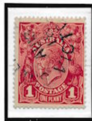
R5-8 Inverted wmk.