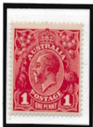
Certificate 451 on back of sheet