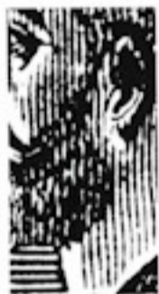
R1-3 KING White spot below King's ear.