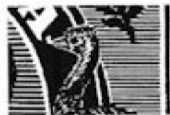
R6-1 Emu. White spur on Emu's beak.