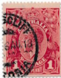
R4-8. early print run