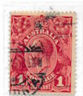
R12-6 early print clear E flaw