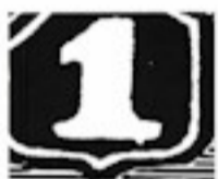
R2-9 RVS White flaw on bottom of numeral 3mm from RF.