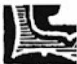
R1-7 BF Rounded notch inside frame 2¼ mm from BLC.