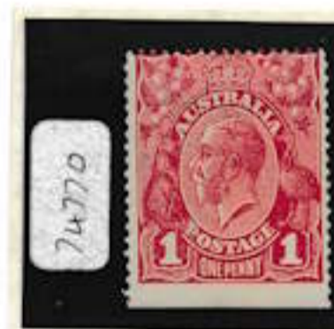
mint Jumped Perf. The long stamp, caused by a jumped perf., was hand trimmed at base in an attempt to pass it off as an imperf at base. Certificate on back of sheet.