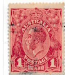
R4-8. mid print run