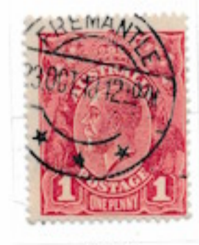
R1-7 late print run

Die 3 flaw R1-7 on cover shown on page 2 under Dates