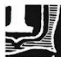
R12-10 BF Round notch ¼mm from BRC.