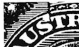
R6-6 White flaw on S of AUSTRALIA that joins with the oval above.