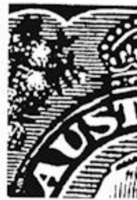
R4-10 3rd State THIN US White flaw in wattle leaf. Top of S flat. Shade break behind King's head.