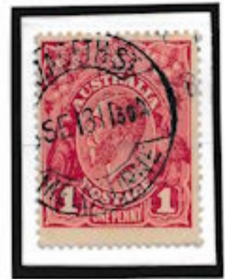
R4-10 1st State Inverted wmk.