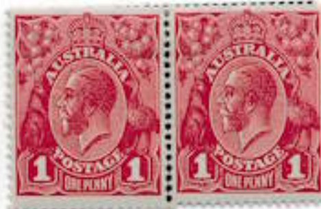
column 6 column 7 Half hole perforation misalignment between columns 6 and 7 column 7 half hole up