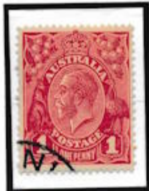
CTO Inverted wmk.