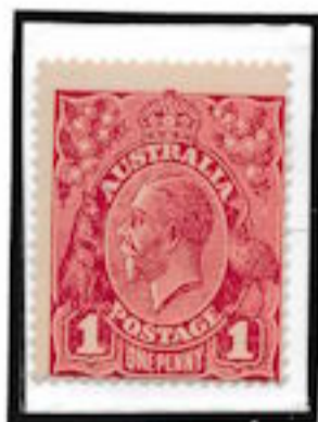
R5-8 mint Inverted wmk.