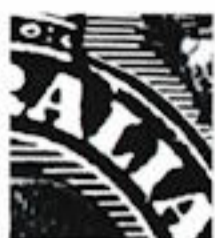
R12-6 AUSTRALIA Spur over L.