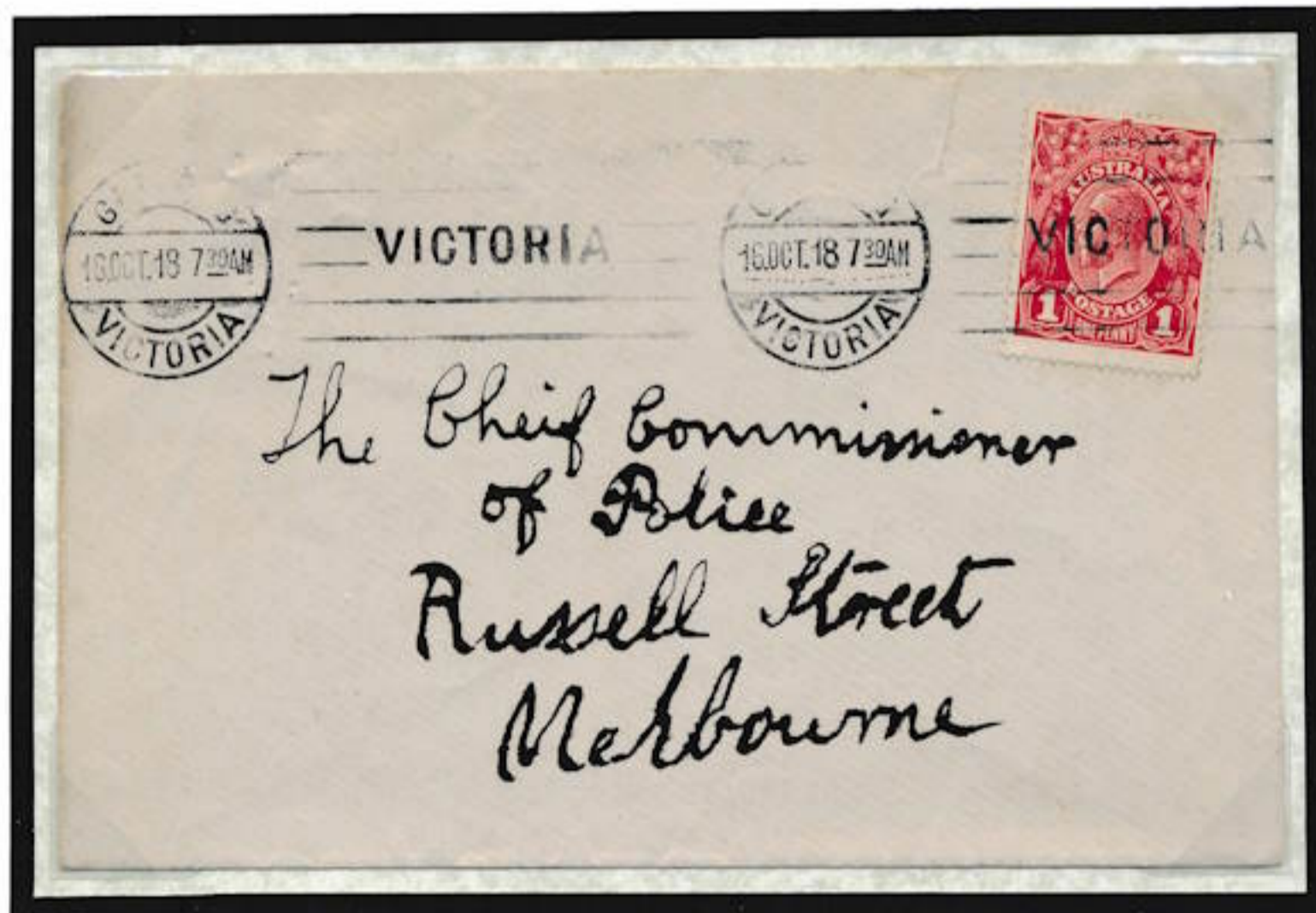
Die 3 R7-8 on cover posted GEELONG VICTORIA 16 OCT 18 to MELBOURNE

letter rate 1d per 1/2oz 1 May 1911 to 29 Oct 1918