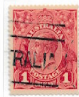
R3-8. late print run