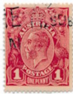
R1-8 mid print run