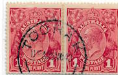
Late use of Die 3 pair

four days earlier than previously recorded Certificate on back of sheet