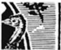
R5-8 S/lines Scratch under right wattle stem.