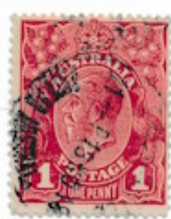
R1-8 late print run