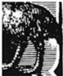
R1-10 White spot under Emu's tail