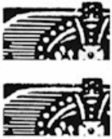
1-8 TF Thinned or broken left of crown