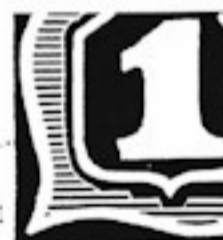
Kiss printing in top left shade lines and down top left frame, between Emu's feet and in right numeral foot, and down bottom left frame.