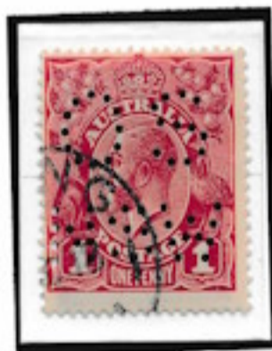
R3-8. OS/NSW mid print run