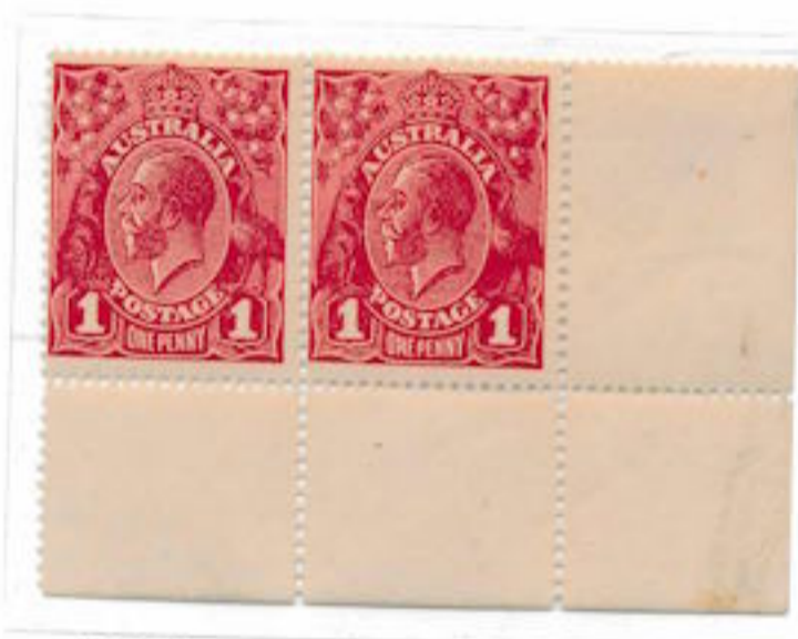
R12-9 R12-10 mint

Pre flaw pair, plated as the last stamp in the sheet