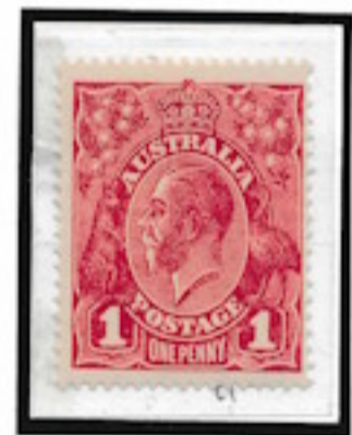
R4-8. Inverted wmk. late print run