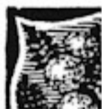
R3-3 TF Small v-notch in TF 1/4mm from TLC.