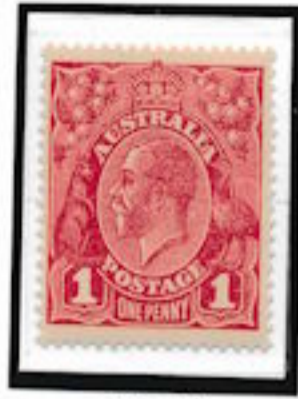
R4-10 1st State mint