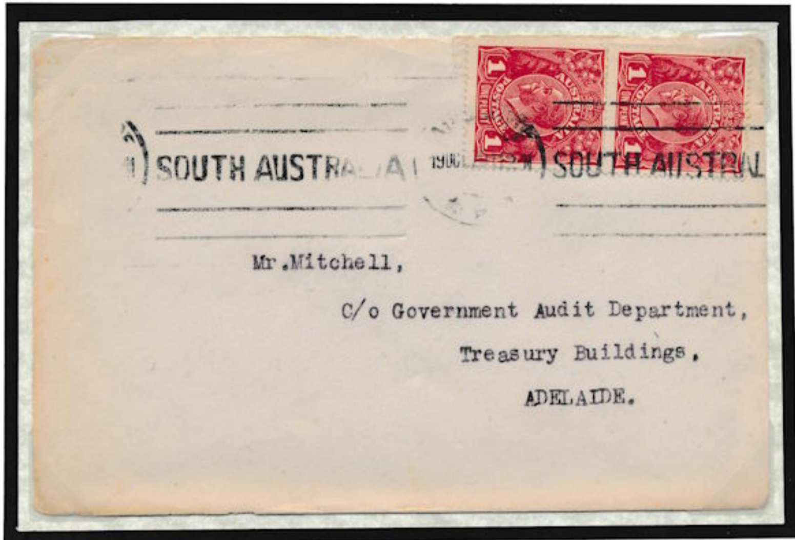
Die 3 R6-1 on cover posted ADELAIDE SOUTH AUSTRALIA 19 OCT 20 to ADELAIDE Stamp R6-1 on left and R5-1 on right letter rate 2d per 1/2oz 1 Oct 1920 to 1 Oct 1923