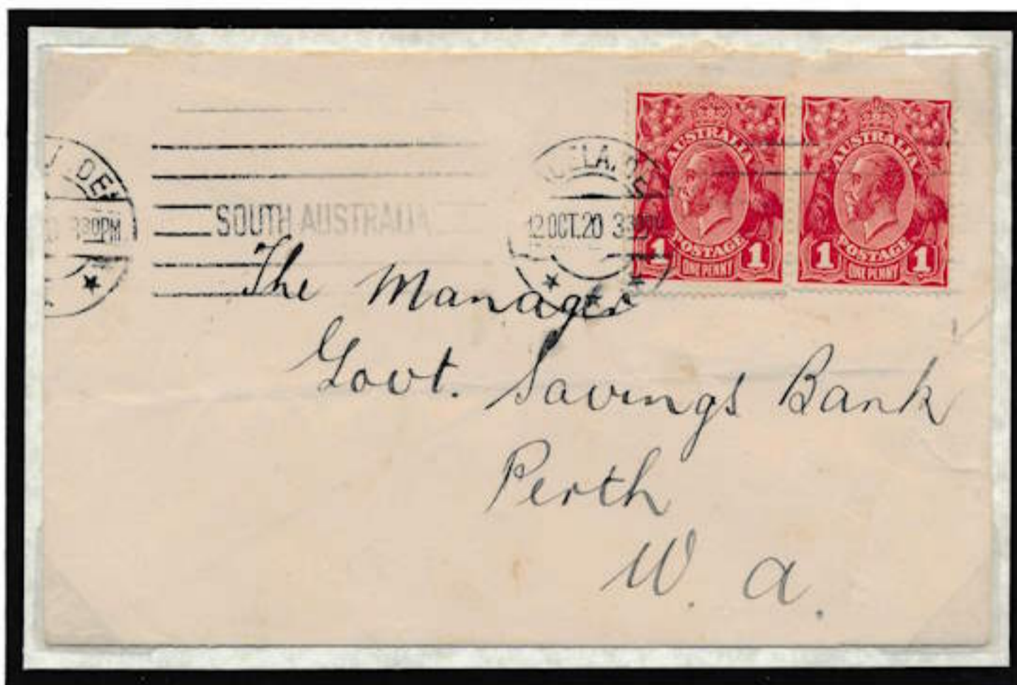
Possible unique pair of Die 3's with full hole diameter of misalignment between columns 6 and 7 on cover

Cover posted ADELAIDE *** SOUTH AUSTRALIA 12 OCT 20 to PERTH W. A.