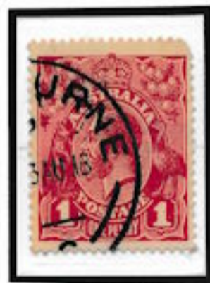
R4-10 2nd State