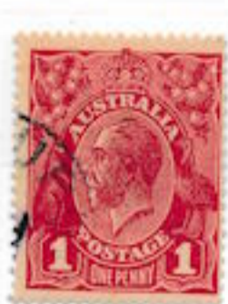
R12-6 mid print partial E flaw