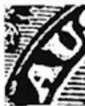
Kiss printing in AU of AUSTRALIA