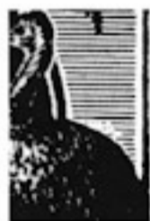
R3-8 Weak shading over Emu's back