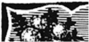
R1-10 TF. Shallow dent 6mm from TLC