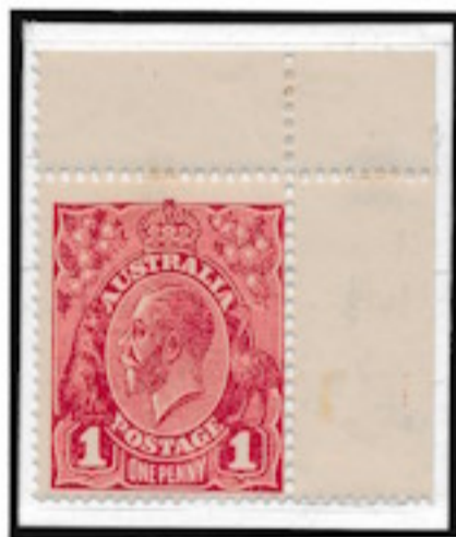
R1-10 mint inverted wmk