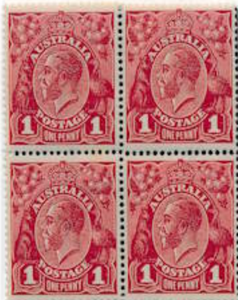
Half hole perforation misalignment between columns 6 and 7 column 7 half hole down