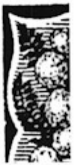
R1-2 LF Small notch 5½ mm from TLC