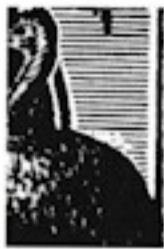
R3-8 Weak shading over Emu's back Inconstant