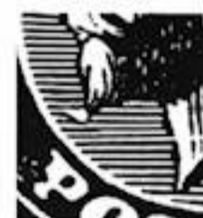
R6-7 White flaw on the tip of the King's beard.