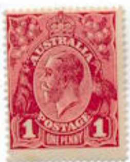
Inverted wmk. mint