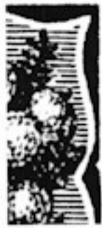
R1-1 RF Small notch 5½ mm from TRC.