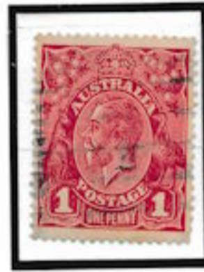
R4-10 1st State