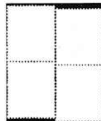
Illustration showing perforation misalignment between columns 6 and 7.

War savings paper sheets used for this issue were smaller than the sheets for the other KGV 1d printings. The printing plate was larger, being formed in one single pane of 120 clichés instead of two blocks of 60 with a gutter in between the blocks. There were no suitable perforating machines available for this sheet of 120. The existing comb perforator that had pins for two columns of six with a gutter between was adapted, by removing the pins of six columns that were normally used for perforating the right pane. The sheets were then fed into the machine and only the first six columns were perforated. The sheet was then rotated 180° and fed back into the perforator to do the remaining four columns. This double perforating process often caused misalignment of the perforations between columns six and seven of one, two or three holes.