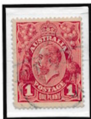
R3-3 Inverted wmk.