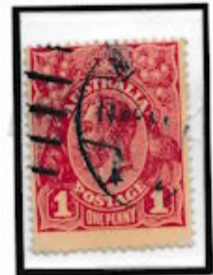
R4-10 3rd State