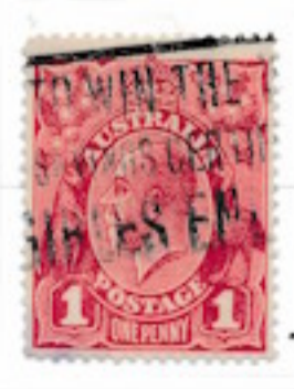
R1-7 early print run