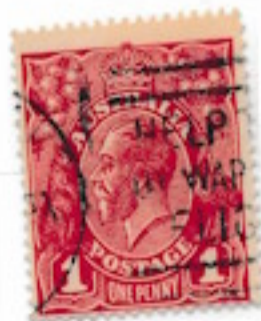
R3-8. early print run