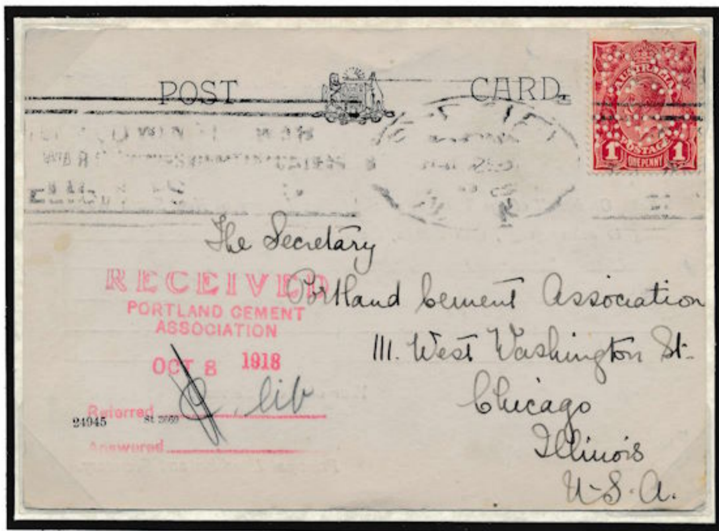
Die 3 OS/NSW on Public Library of NSW postcard posted SYDNEY N. S. W. AU 29 1918 to Chicago Illinois U.S.A

There was a special 1d postcard treaty rate between Australia and the U. S. A. from 1 May 1912 to 30 Sep 1920.