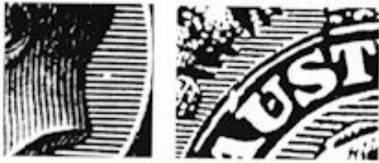
R4-10 1st State US of AUSTRALIA and white frame over US thinned. Small white flaw in the U. White flaw over and left of U. Shade break behind King's head.