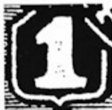
Kiss printing in AUSTRALIA and in left value shield numeral