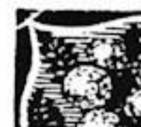
R7-8 TLC Cut almost severing the corner