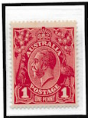
Certificate 450 on back of sheet

Kiss print a term to describe linear duplication in a design caused by the paper flapping against the plate either before or after impression.