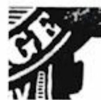
R12-6 POSTAGE middle and bottom bars of E joined.