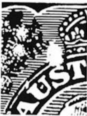
R4-10 2nd State US of AUSTRALIA and white frame over US thinned. Small white flaw in the U. White flaw over and left of U. White flaw over S