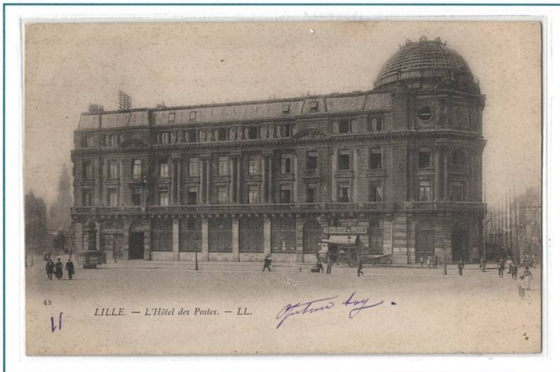
Collotype Printing. Card No 43. Undivided Back.

Card on Top and Bottom shows Hotel des Postes in Lille The Building is now a local Government office.