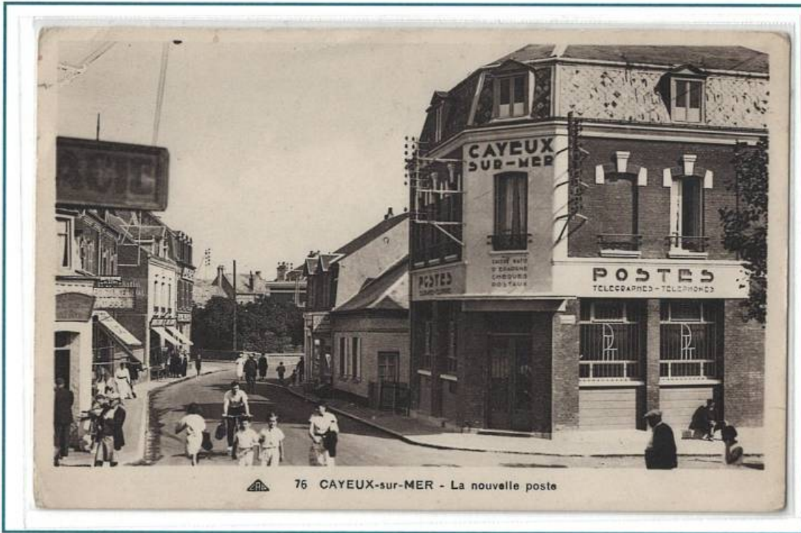
La Poste Cayeux-sur- Mer Collotype Printing. Card No 76. Published by Galeries Modernes. Divided Back. Building no longer exists