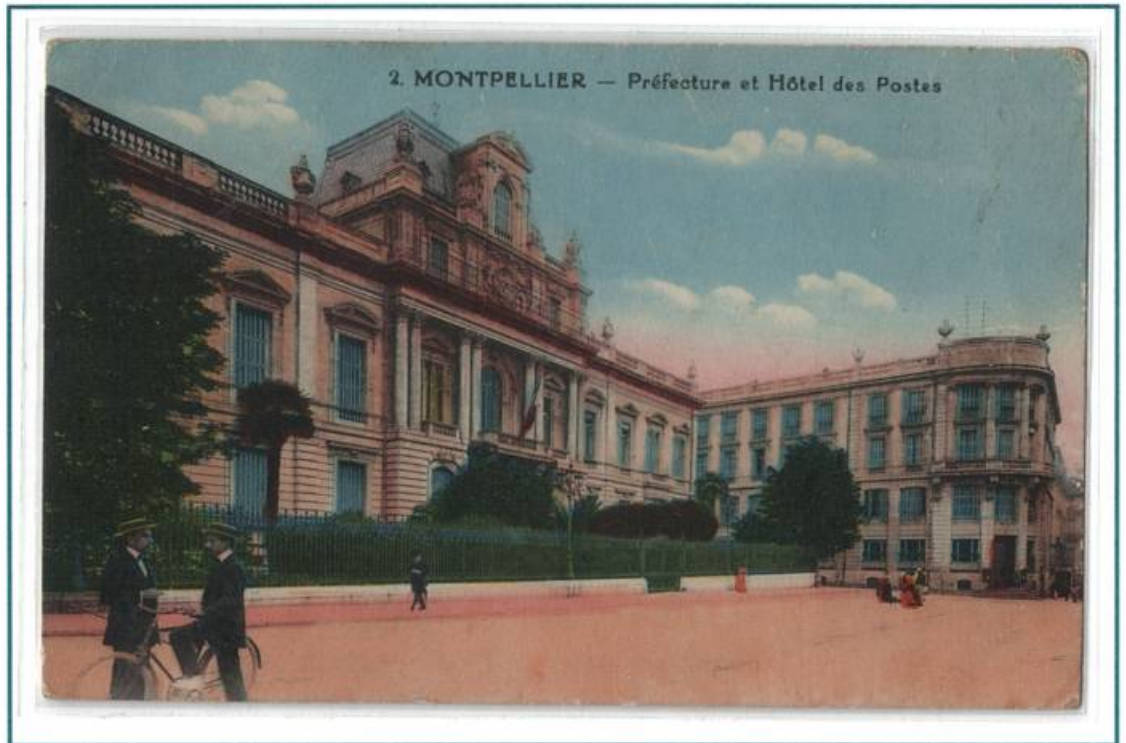
Hotel des Postes in Montpellier Coloured Collotype Printing. Card No 2. Published by A Bardou. Building is now a Local Government Office.