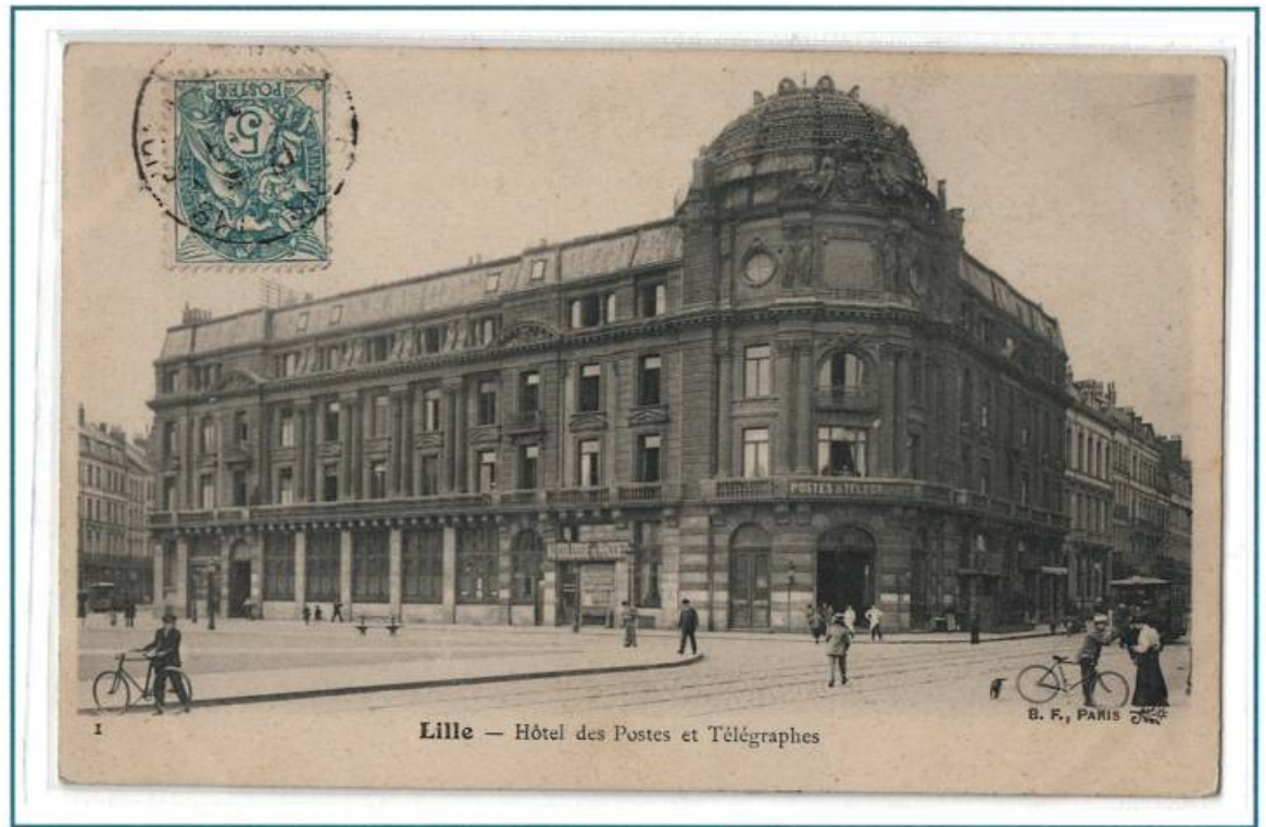
Collotype Printing. Card No 1. Divided Back. Published by BF Paris.

Some of these buildings had a combination of multiple architecture styles like these showing a cusp of Neo Classical and Art Deco style.