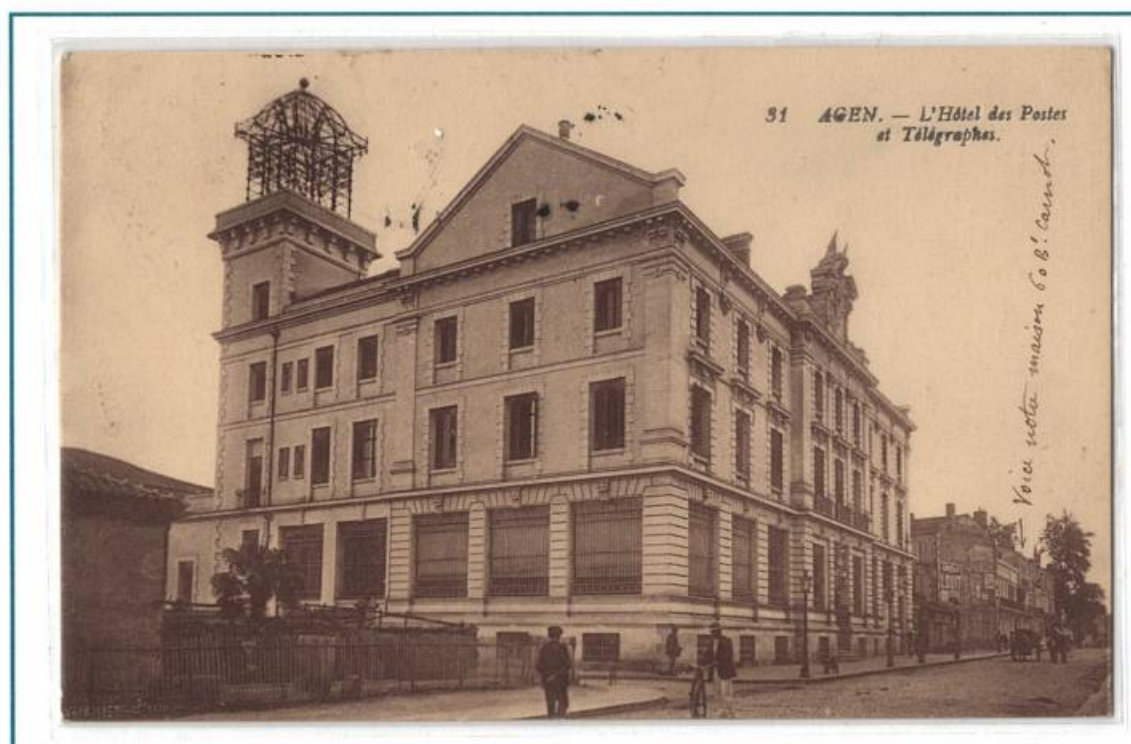
Hotel des Postes in Agen

Building now broken down to make way for a new post office