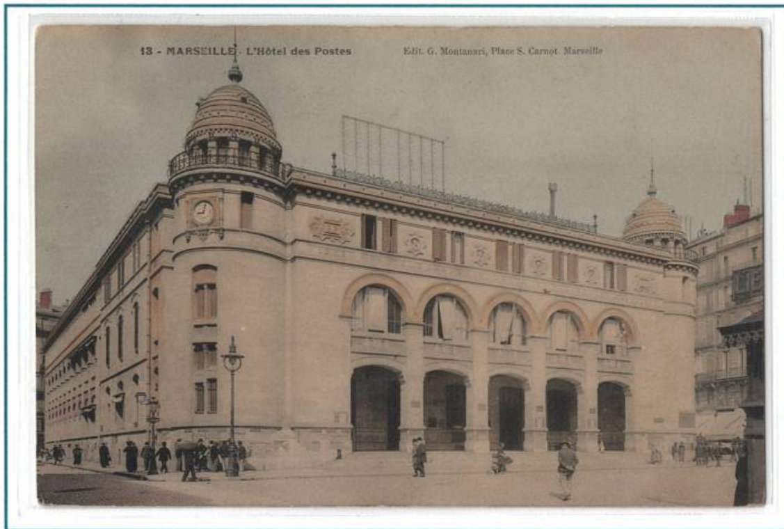
Coloured Collotype Printing. Card No 13. Divided Back. Published by G.Montanari.

Card on Top and Bottom shows Hotel des Postes in Marseille. The Building is now has offices, shops and a hotel