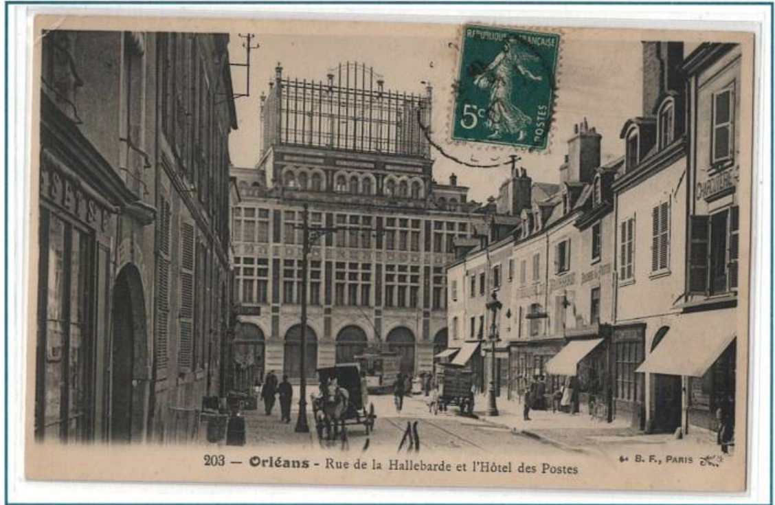
Hotel des Postes in Orleans

Some of these buildings had a combination of multiple architecture styles like these showing a cusp of Neo Classical and Art Nouveau style.