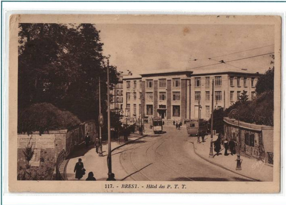
Hotel des Postes in Brest

Collotype Printing. Card No 117. Published by G Artaud. Divided Back. Used in 1933.