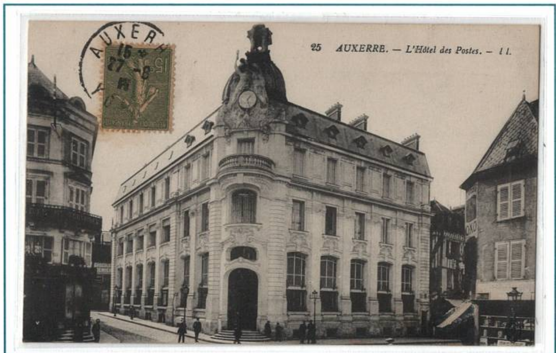
Coloured Collotype Printing. Card No 25. Divided Back. Published by Levy

Card on Top and Bottom shows Hotel des Postes in Auxerre. The Building has now been broken down to house a new post office