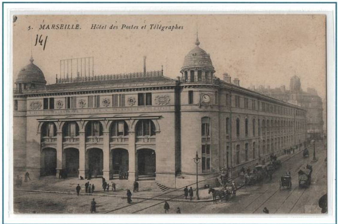
Collotype Printing. Card No 5. Divided Back

Main features of Art Nouveau architecture are asymmetric lines, or triangles or arches, curves and motifs inspired by natural elements.