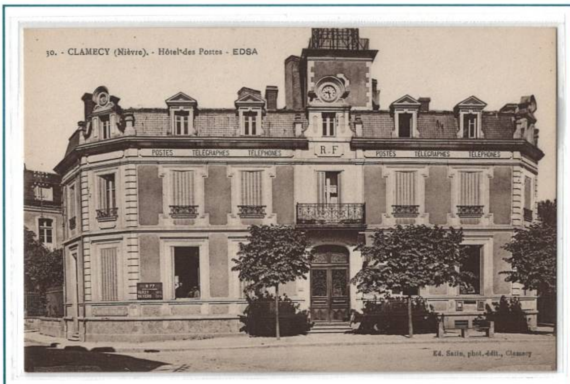
Hotel des Postes in Clamecy Collotype Printing. Card No 30. Published by Satin. Building no longer exists