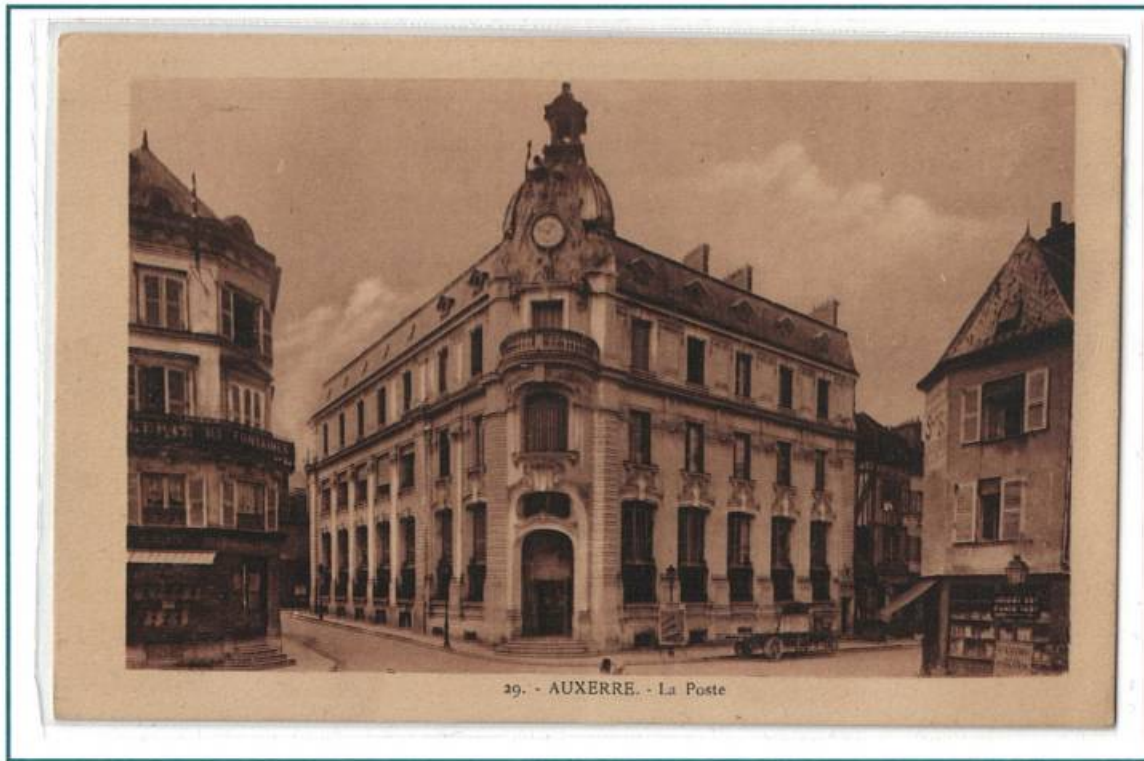
Collotype Printing. Card No 29. Published by Bonnet Journaux. Divided Back

Card on Top and Bottom shows Hotel des Postes in Auxerre. The Building has now been broken down to house a new post office