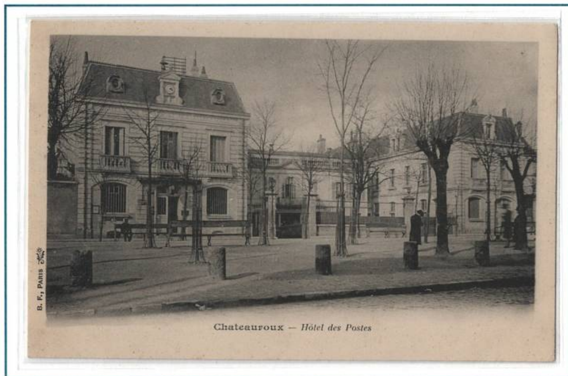
Hotel des Postes in Chateauroux

Collotype Printing. Undivided Back. Published by BF Paris.