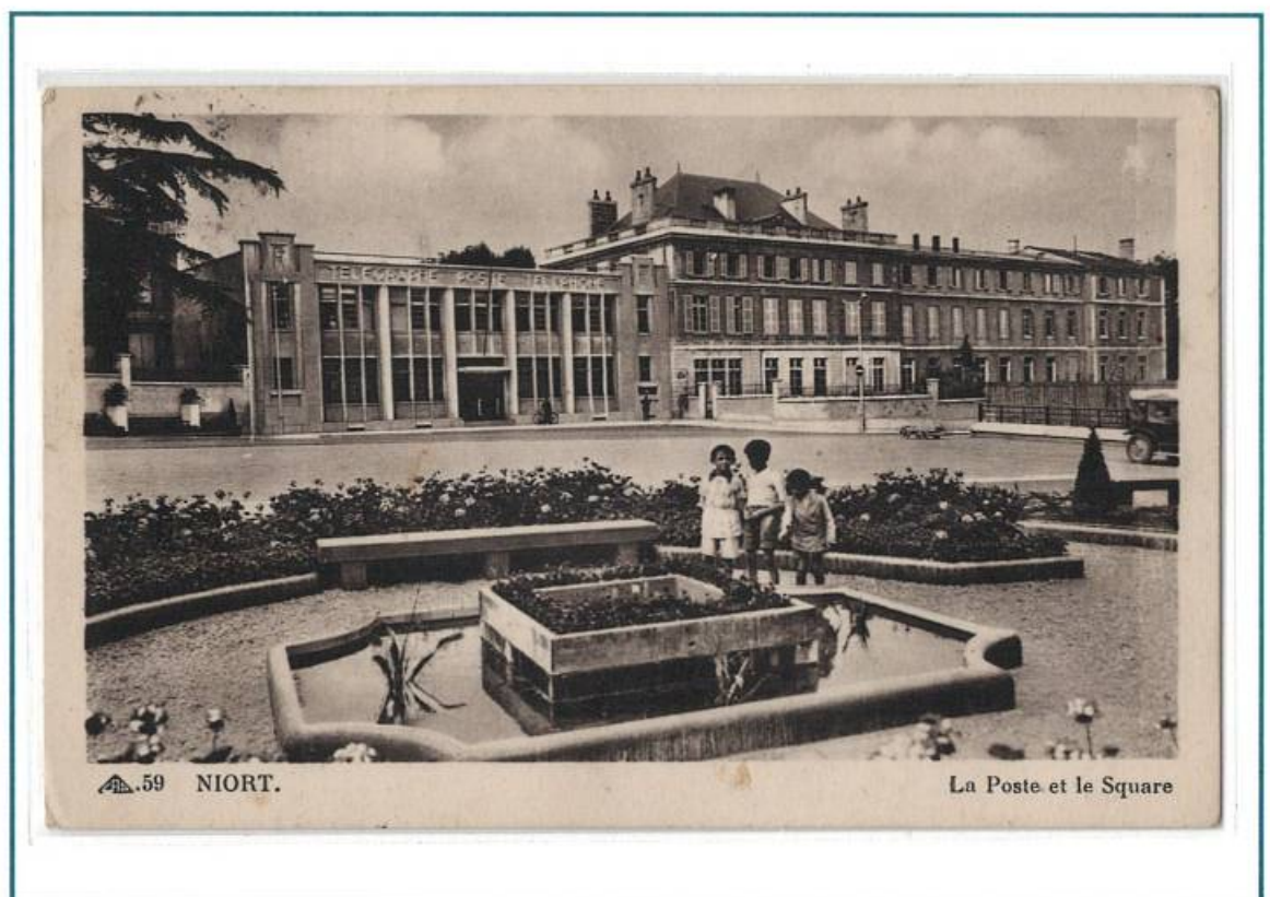
La Poste Niort

Building Destroyed in World War II bombing