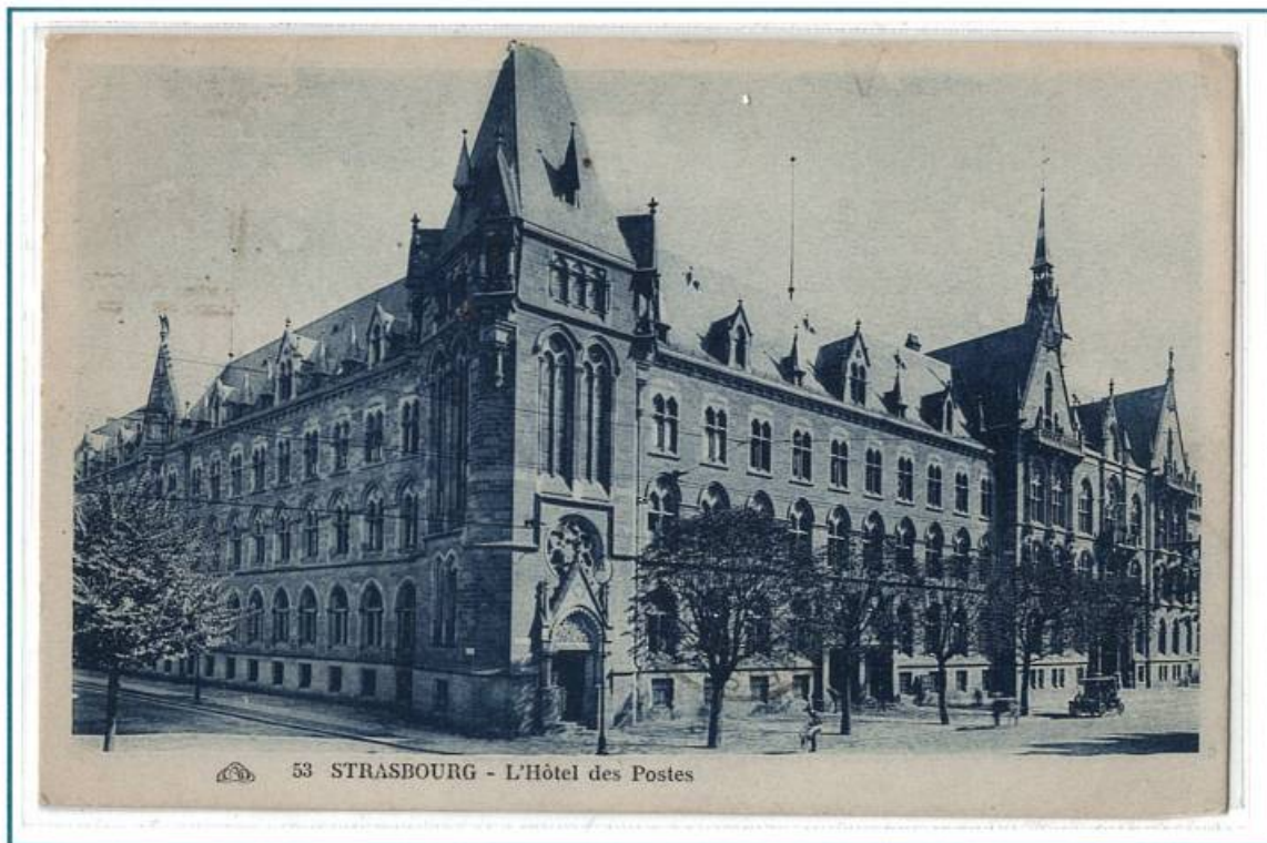
Hotel des Postes in Strasbourg

Collotype Printing. Divided Back. Card No 203. Published by BF Paris. Building destroyed in World War II bombing.