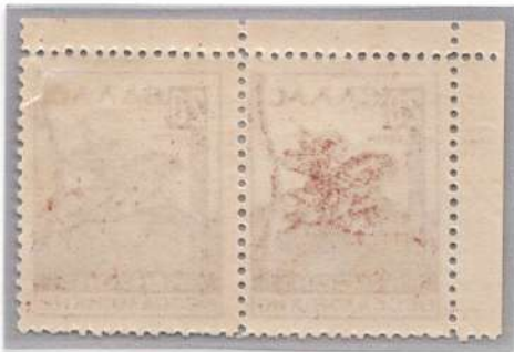
Partial decalque on back side