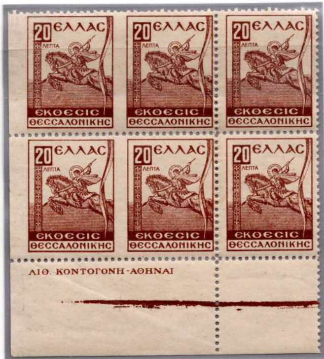
Blocks without vertical perforation on the left and center