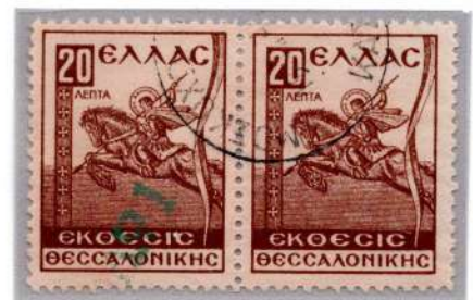
Diagonal surcharge only at first stamp