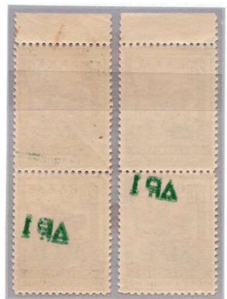
Pair with one stamp Decalque