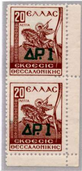
Pair with imperfect perforation in the middle