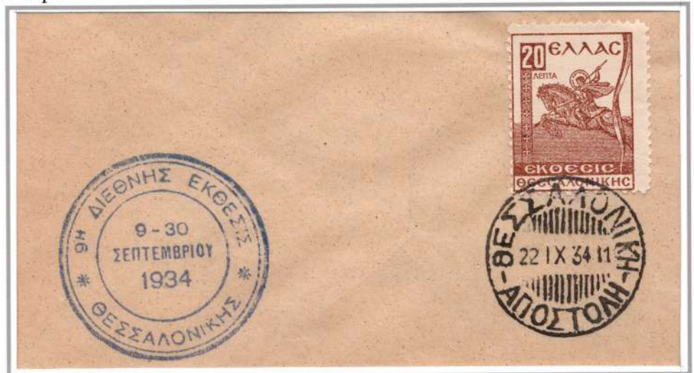
Cover with the special 20-cent stamp for the TIF with First Day of Issue cancellations and a commemorative stamp of the 9th TIF.

Postal items coming from the Post Offices of Thessaloniki, which did not bear, in addition to the regular postal rates, the additional 20-lepta special charge for the TIF, were considered insufficiently prepaid and the recipient was obliged to pay twice the missing additional charge, which was collected by means of postage due stamps.