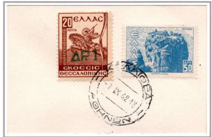
Cover with the special 1 Dr/20 Lepta stamp for the TIF with First Day of Issue