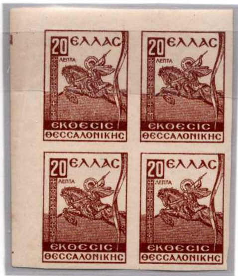
Block without perforation