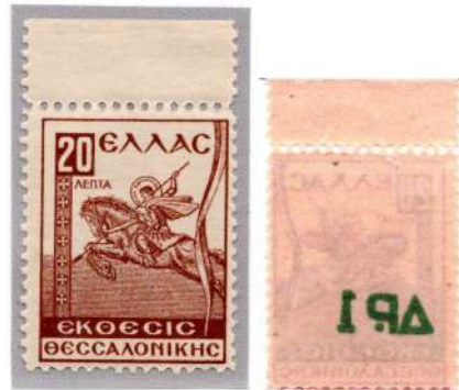
Without surcharge on face