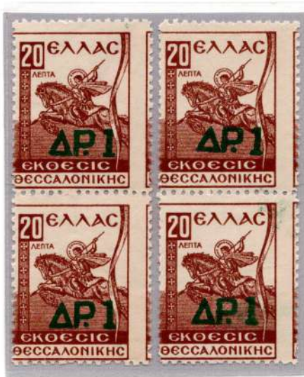
Vertical displaced perforation