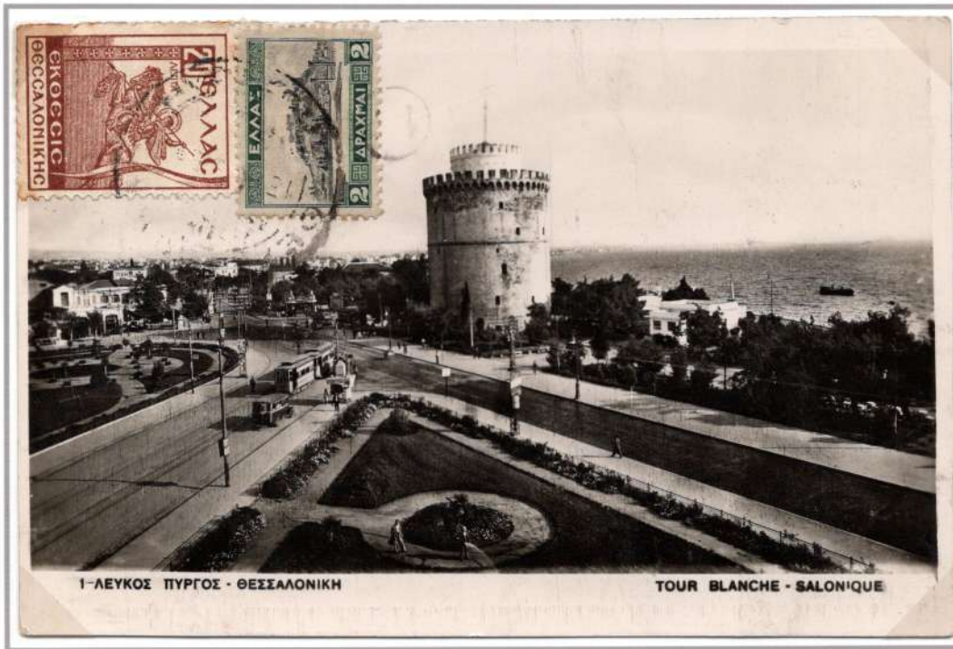
Picture postcard "Thessaloniki, White Tower" with 2 Drs postage stamps & 20 Lepta TIF Fund, posted from ΘΕΣΣΑΛΟΝΙΚΗ ΑΠΟΣΤΟΛΗ 15.9.1935 to Piraeus . Postal Rates 2.20 Drs: 2 Drs for postcard & 20 L for TIF .