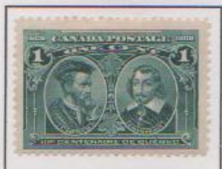
ULm4: Redrawn top 6 lines (1-5 mm) & vert. line (1 mm)