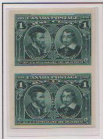
Deep green on ungummed paper