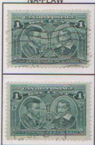
ULf1: In "NA" of 'Canada'.