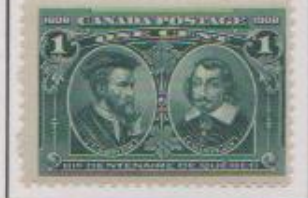
ULm3: Redrawn top 4 lines (1 mm) & vert. line (5 mm)