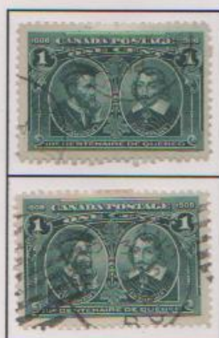
LRm4: Bottom 2 lines pinched below "BE" of 'Quebec'

(from own original research and classification, where 'm' means 'major')