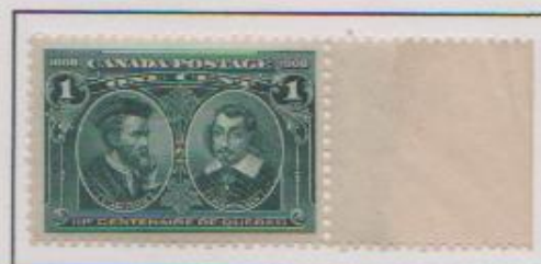
URm2: Redrawn top 2 lines (7 mm)