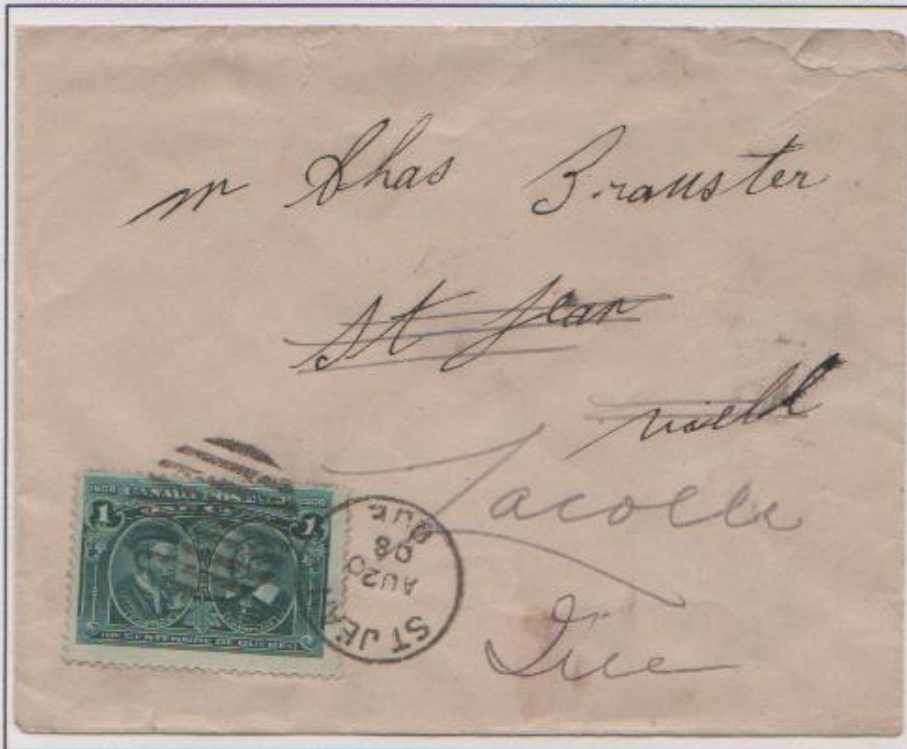
CDS postmark: ST JEAN QUE AU 20 08 split circle backstamp: LACOLLE QUE AU 20 08

addressed to ST JEAN, Ville (city) then readdressed to LACOLLE, Que.