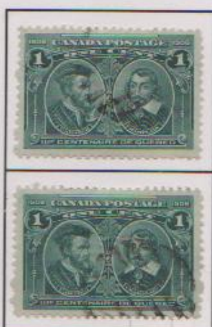
ULs3: Broken vertical line + dots in margin