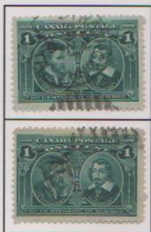
LRm2: Bottom 3 lines merge (2.5 mm)