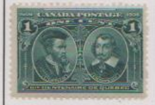
LRm2: Bottom 3 lines merge (2.5 mm)

(from own original research and classification, where 'm' means 'major')