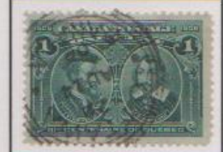
URm4: Redrawn 3 lines above "A" of 'Postage'.