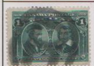
URm6: Redrawn top 3 lines (4-5 mm)