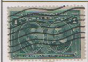
URm5: Redrawn top 5 lines (5.5-7 mm)