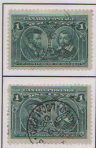
ULs2: Redrawn 4th & 6th line (2 mm)