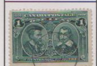
URm7: Redrawn top 5 lines (2 mm)

(from own original research and classification, where 'm' means '')