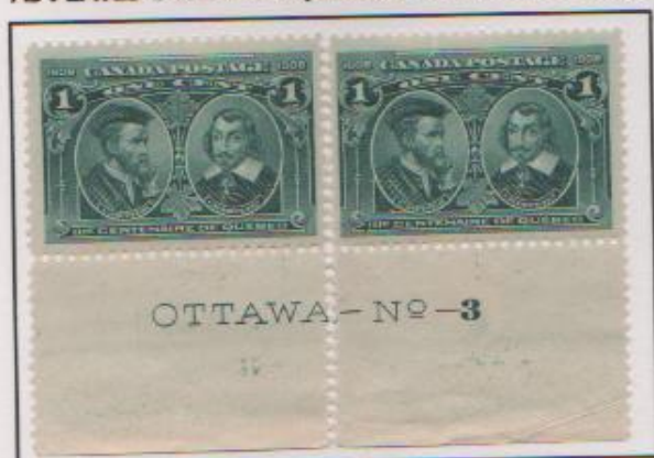
Each P.O. pane of 50 has only one stamp with inscription

As PLATES 3 & 4 were printed in sheets of 200, they also had lower plate inscriptions.