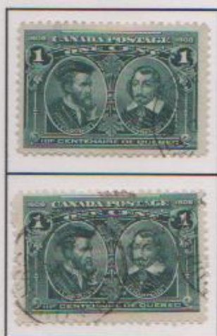
LRm3: Bottom 2 lines merge (7.5 mm)