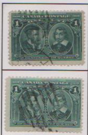
LRs3: Extended 3rd line