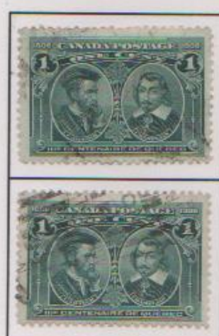
LRs1: 3 extended lines

(from own original research and classification, where 's' means 'strong')