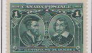
ULm1: Redrawn 4th line (5 mm)