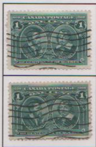
ULm3: Redrawn top 4 lines (1 mm) & vert. line (5 mm)