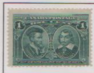
URm1: Redrawn top 3 lines (6.5-7 mm)