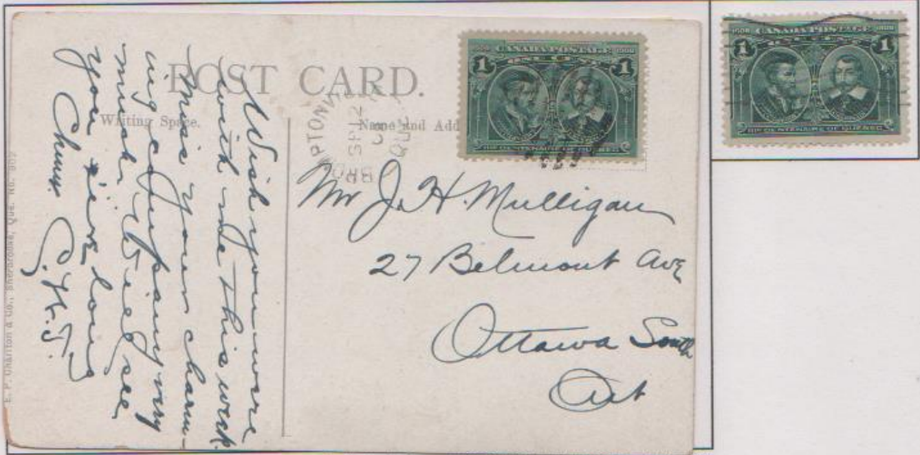
Split Circle Cancel: BROMPTONVILLE QUE. SP 12 08

UNRECORDED MAJOR VARIETY URm1 TOP THREE LINES REDRAWN: for 5 mm in the UR corner.