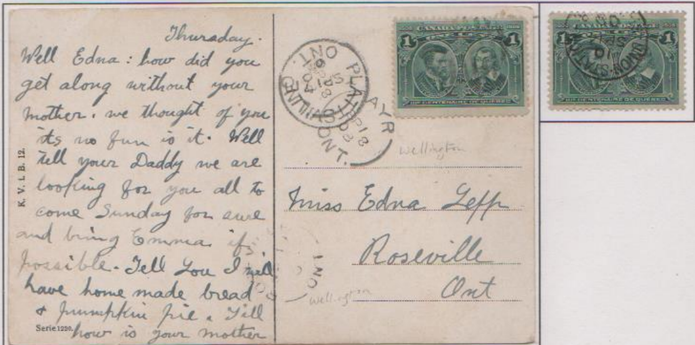
CDS postmark PLATTSVILLE, ONT. SP 17 08; Split Circle Transit : AYR, ONT. SP 18 08 and Receiver: ROSEVILLE, ONT. SP 19 08

REDRAWN 4th line above 'E' of 'POSTAGE'.