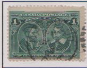
URm1: Redrawn top 3 lines (7 mm)