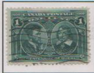
URm3: Redrawn top 3 lines above "E" (3 mm)