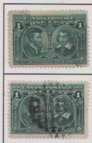
ULm4: Redrawn top 6 lines (1-5 mm) & vert. line (1 mm)