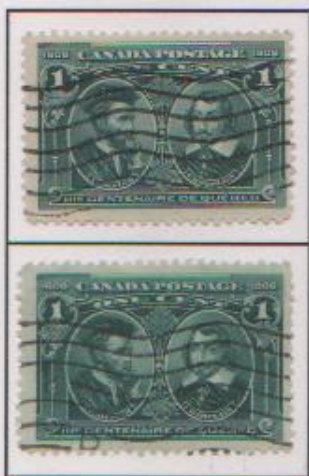
ULm2: Redrawn top 4 lines (4-7 mm) & vert. line

SEVEN MAJOR PLATE RETOUCHES at the corners (UL,LRm#).