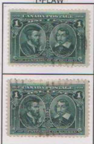
URf1: In "T" of 'Postage'.