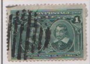
URm2: Redrawn top 2 lines (7 mm)