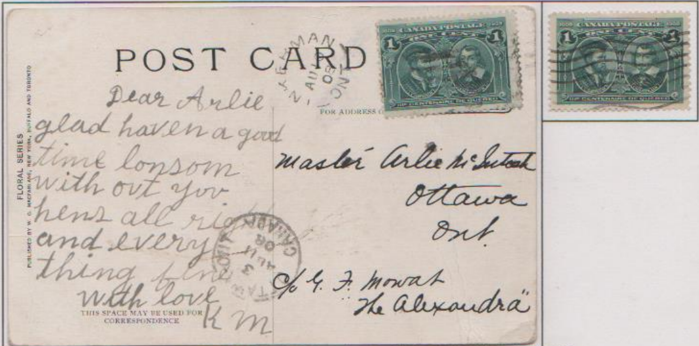
Split Circle Postmark: INKERMAN ONT AU 10 08; CDS receiver: OTTAWA ONT CANADA 3 AU 11 08

REDRAWN-4th horiz. line in UL corner of stamp.