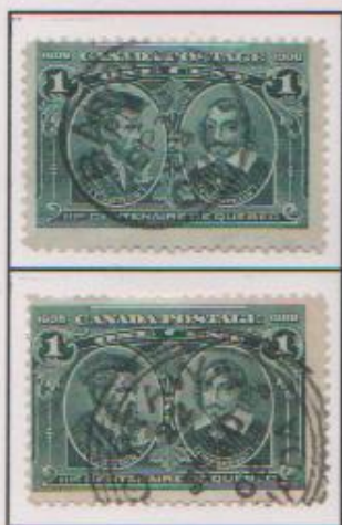
LRm1: Short 7th (white) line