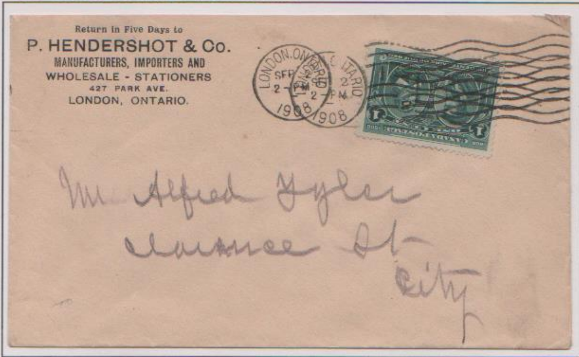
Double-struck postmark: LONDON, ONTARIO SEP 2 2 PM 1908