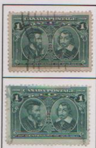
LRs2: White space below "C" of 'Quebec'.