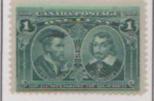
LRm1: Short 7th (white) line