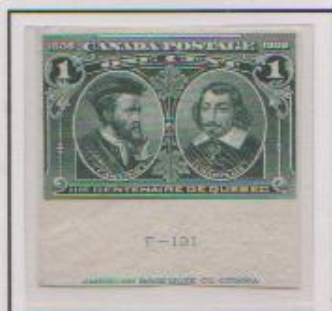
Die number: "F-191" AMERICAN BANKNOTE CO. OTTAWA