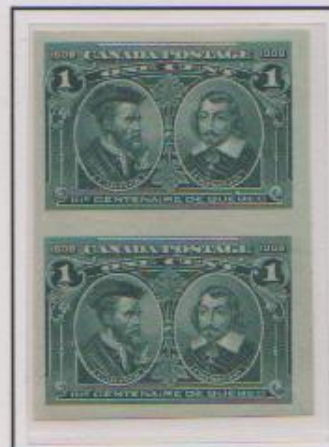
On gummed wove paper

Only 25 pairs of imperforates recorded of each type