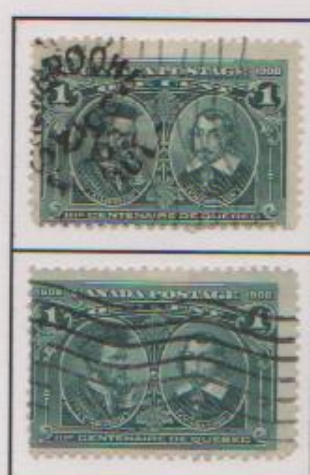
URs3: Redrawn top line above "9"